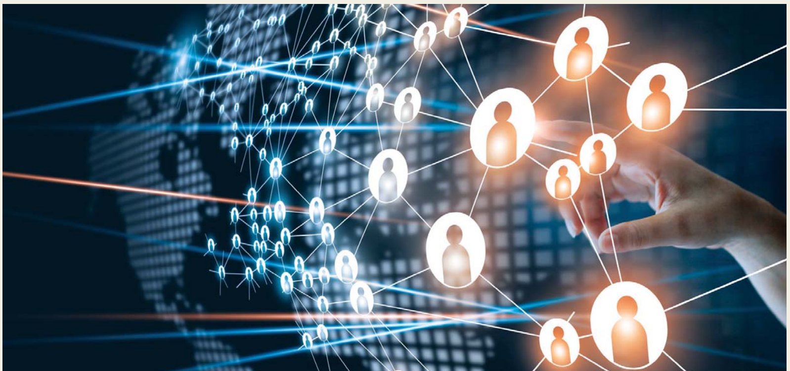
IDEM brought together a global community of dental professionals while respecting social distancing requirements, reaffirming its position as Asia Pacific's key dentistry event, renowned for learning and networking.

Neither were social activities curtailed. Three separate networking nights held over the course of the two-month event brought together colleagues old and new. The networking nights featured themes pertinent to the community, such as the future of dentistry, the impact of COVID-19 on the dental industry, and their visions for the next iteration of IDEM.