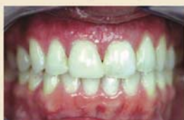
Fig. 3: Thanks to office systems that anticipate such occurrences - and appropriate technologies that enable response - the patient leaves two hours later, happy to have her smile back.

scheduled the patient and gave her a fee range to expect for