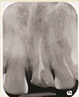
Fig. 1: Assistant takes X-ray and gets it to them dentist to help with initial diagnosis.

Because our practice has six operatories and a great staff, we are able to work these patients into our schedule.