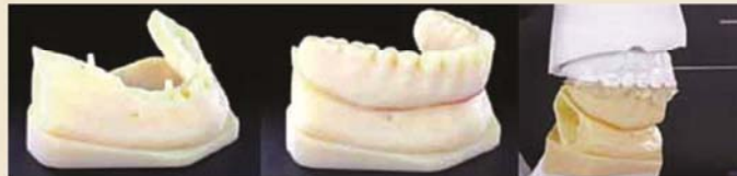
Fig. 2a-2c: The DICOM data was segmented for density, and models of the patient's mandibular arch, provisional denture and surgical guide were 3-D printed and articulated, so the entire surgical and prosthetic stack could be examined and a surgical index fabricated on the articulated model between the guide and maxillary cast.