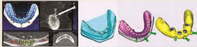
Fig. 1: After digitally evaluating the quality and quantity of mandibular bone, implants and multi-unit abutments were virtually placed with the appropriate angling and depth for the bone morphology of the patient.