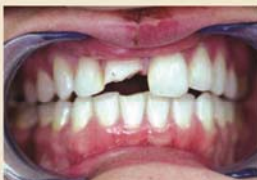
Fig. 2: Frantic, 32-year-old woman in pain with a fractured central incisor requests an emergency appointment because she couldn't go into work looking the way she did.