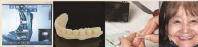
Fig. 4a-4d: From left, the digital impression; printed try-in prosthesis model; the setup on the milled bar; and the final prosthesis.

for density, and models of the patient's mandibular arch, provisional denture and surgical guide were 3-D printed and articulated, so the entire surgical and prosthetic stack could be examined and a surgical index fabricated on the articulated model between the guide and maxillary cast (Figs. 2a-c).