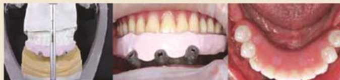
Fig. 3a-3c: From left, a surgical index was used to help ensure accurate positioning of the surgical guide; the provisional prosthesis in place; and, finally, the framework and setup were processed into acrylic at the lab to produce the final denture.