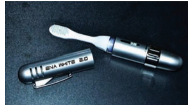
Fig. 1: Bleaching system ENA White 2.0: toothbrush with dispenser containing hydrogen peroxide bleaching gel with special activator XS 151, which increases its absorption rate exponentially.

Afterwards, the companies of the dental field worked hard to improve these procedures, such as designing pre-filled trays or changing the flavour of the gel. The method is substantially the same, only the percentage of hydrogen peroxide (also available as carbamide peroxide) may vary from 10 % to 30 %.[6,7] This influenced the contact period, which is at least from a couple of hours a day (for percentages that are only allowed for cosmetic bleaching) to all night long. All of them start from a single assumption: the bleaching action of peroxide needs a variable contact period to penetrate through the enamel prisms and the dentinal tubules, releasing active oxygen and allowing the free radicals to attack the chromophore particles and reach the