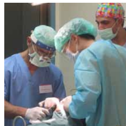
Q-Implant Marathon participants in Santo Domingo working in a team.

The atmosphere is harmonious: even after 12 hours in the surgery room, the groups still like to meet for an evening