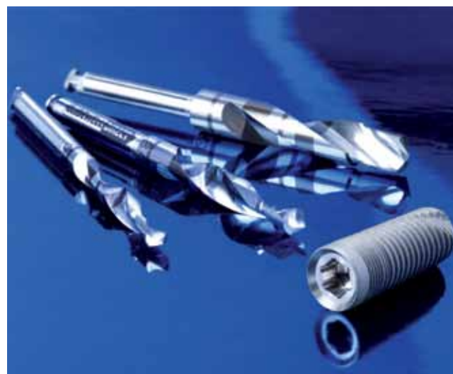
Fig. 3: Inclusive Tapered Implant and disposable surgical drills