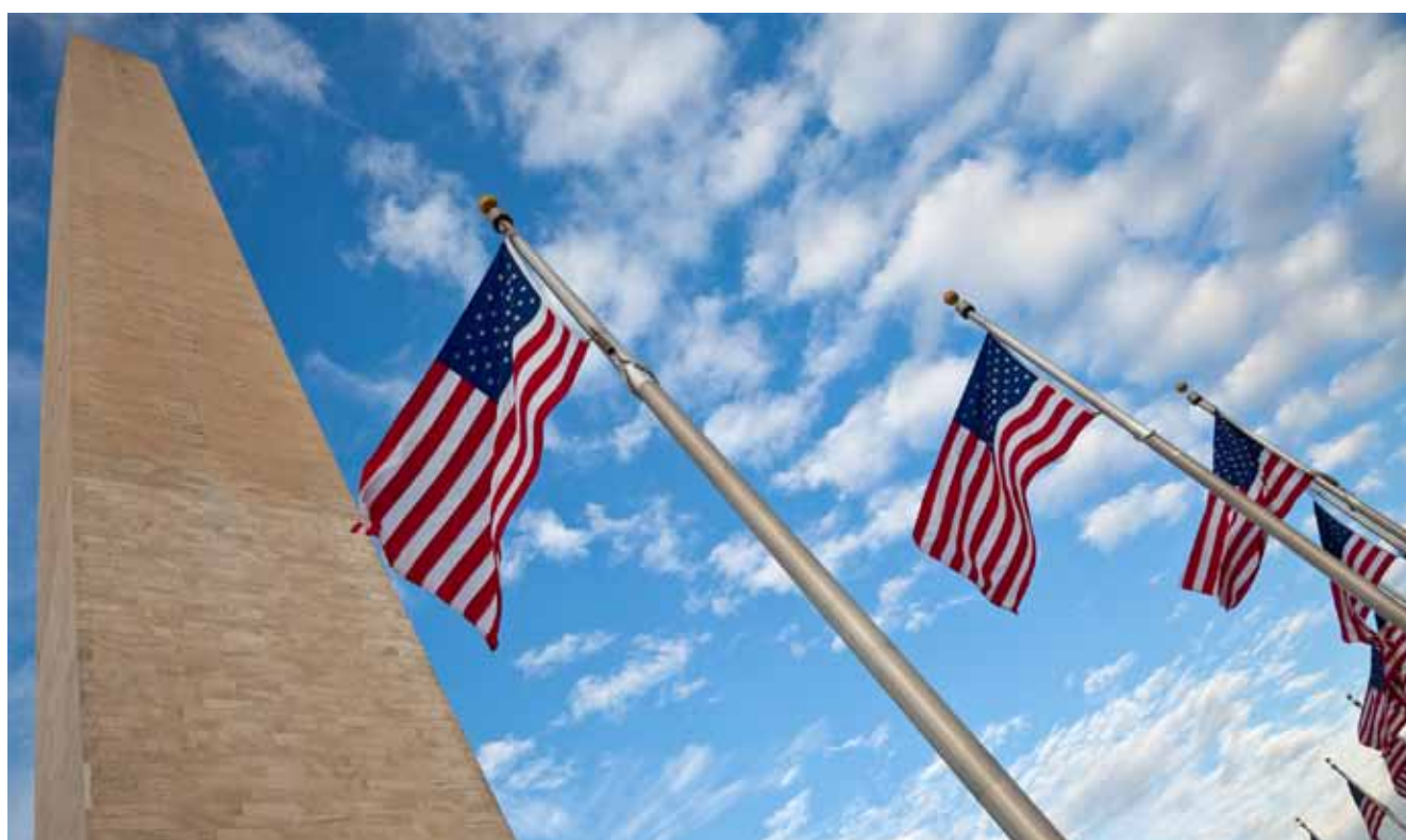
Head to the nation's capitol this Oct. 3-6 to participate in the AAID's 61st Annual Meeting.

Provocative implant dentistry on tap at AAID 61st Annual Meeting