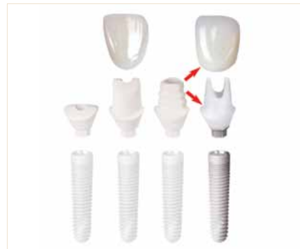
Fig. 4: Final Inclusive Custom Abutment and final BruxZir or IPS e.max crown

the components, delivered to you in an all-inclusive box (Fig. 1), including: