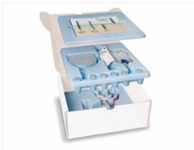
Fig. 1: Inclusive Tooth Replacement Solution.

Once you've selected a diameter and length of implant, forward the diagnostic materials (impressions, models, bite registration, shade, implant size) to Glidewell for fabrication of the custom components. The laboratory will pour and articulate the models and assemble