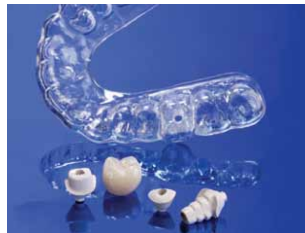
Fig. 2: Prosthetic guide, custom temporary abutment, BioTemps provisional crown, custom healing abutment and custom impression coping.