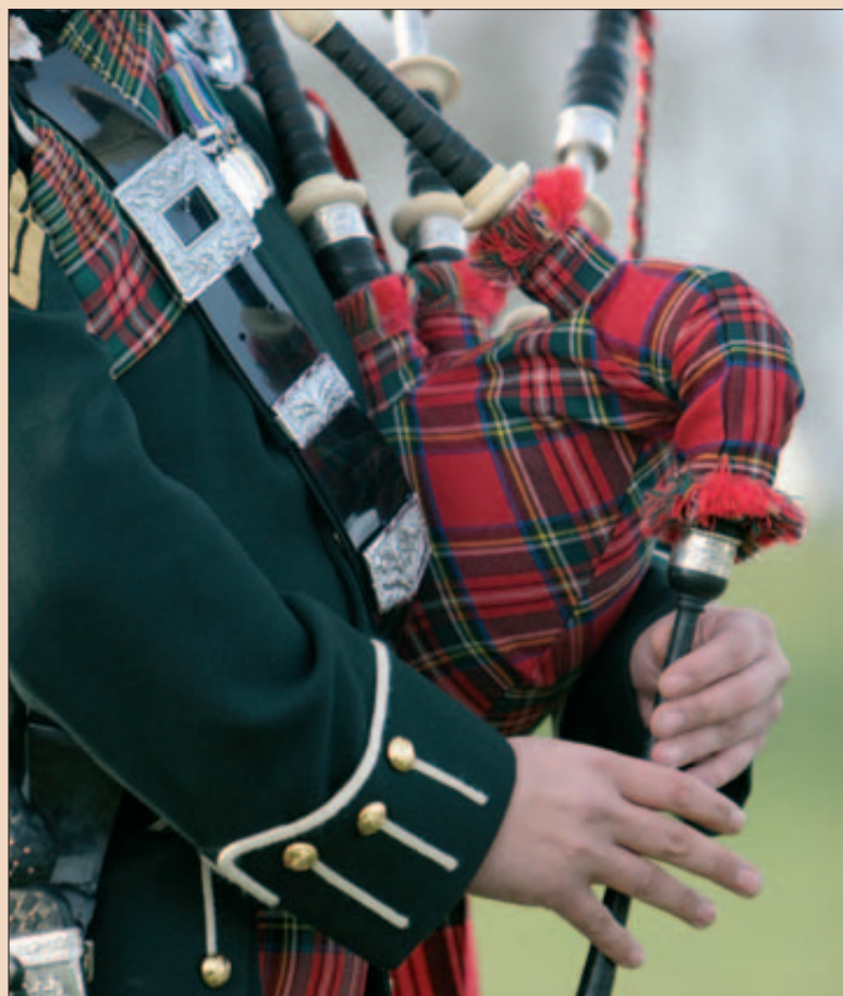
More Scots than ever before have registered with a NHS dentist

He said: ‘There is only one way to solve it and that is for the Scottish Government to sit down and negotiate with the British Dental Association to change terms and conditions and bring them back into the NHS.’ DT