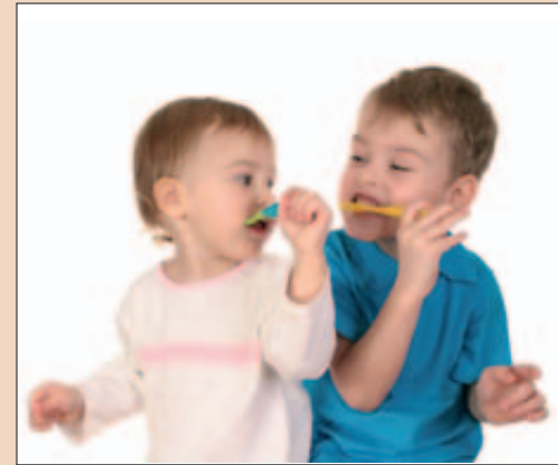
The children involved are aged between two and six-years-old

The Department of Health claims that when fluoride varnish is applied two to three times a year to the biting surfaces of teeth, it reduces tooth decay by 30-40 per cent. D