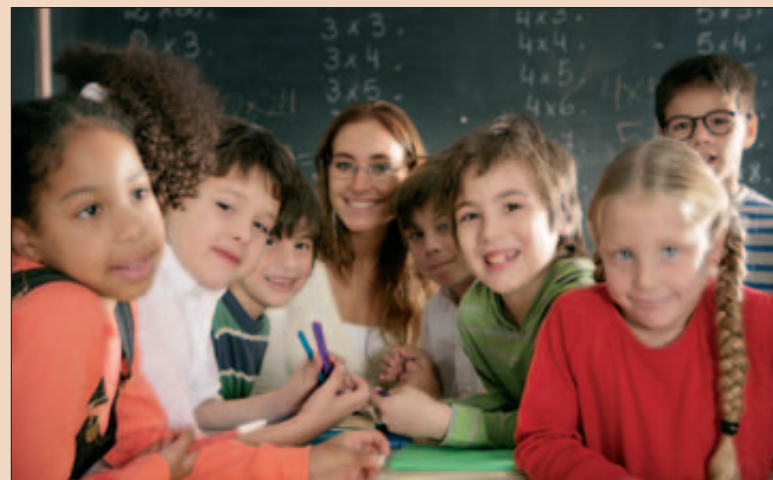
Welsh children will receive oral health advice as well as toothpaste and toothbrushes