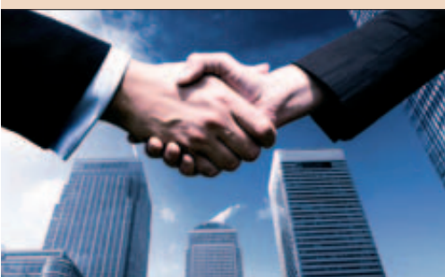
The schools will develop joint research opportunities

Dental Tribune UK Ltd makes every effort to report clinical information and manufacturer's product news accurately, but cannot assume responsibility for the validity of product claims, or for typographical errors. The publishers also do not assume responsibility for product names or claims, or statements made by advertisers. Opinions expressed by authors are their own and may not reflect those of Dental Tribune International.