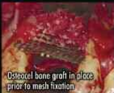
Osteocele bone graft in place prior to mesh fixation