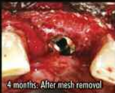
4 months: After mesh removal