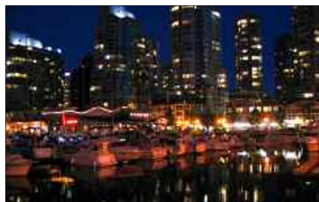
Vancouver, Canada, is the site for ICOI World Congress XXVI, 12th Annual IPS Symposium and 12th Congress of Asia Pacific Section from Aug. 20-22.

The consumer is demanding implant treatment and the industry is responding. Double-digit increases in implant placement and restoration will be the norm during the next several years. Obviously, keeping up with the ever-changing science and clinical techniques is a challenge