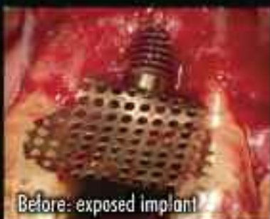
Before: exposed implant