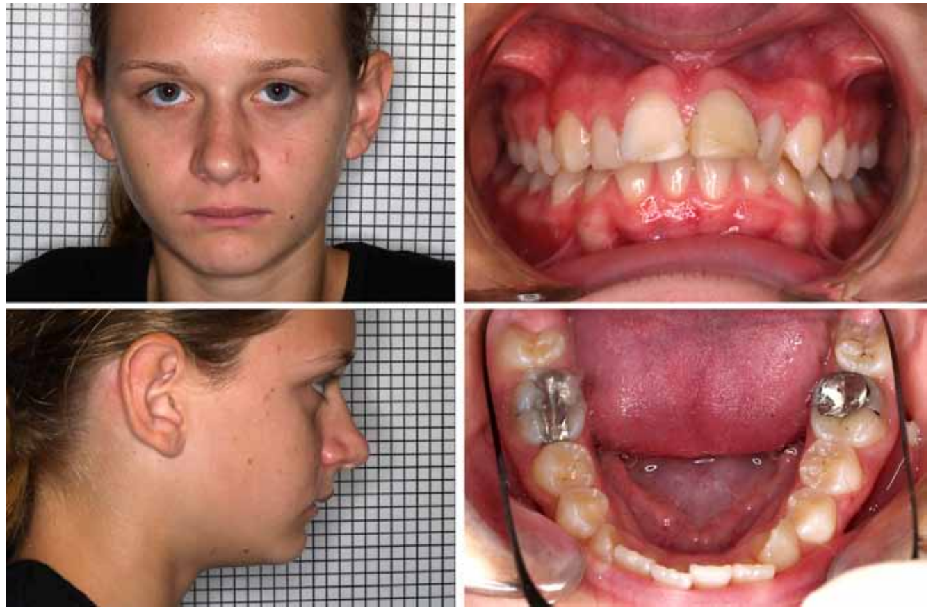
Fig. 1a–1d: Before treatment, December 2009.