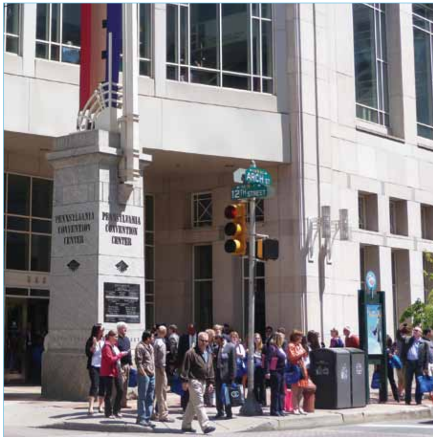
AAO attendees head out of the Philadelphia Convention Center during a lunch break at the meeting in May.