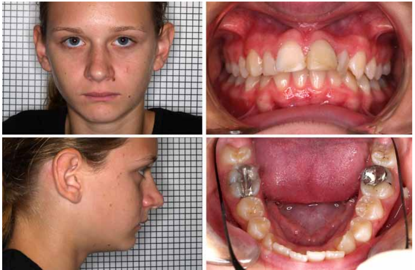
Fig. 1a–1d: Before treatment, December 2009.