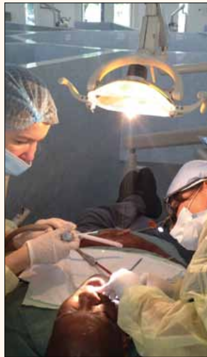
Course participants performing implant treatment.