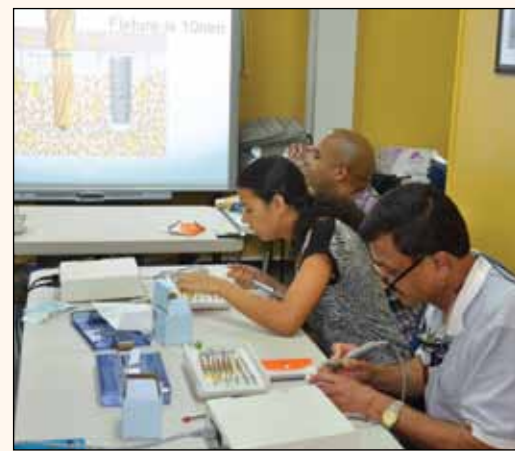
Course participants practice on anatomic models.