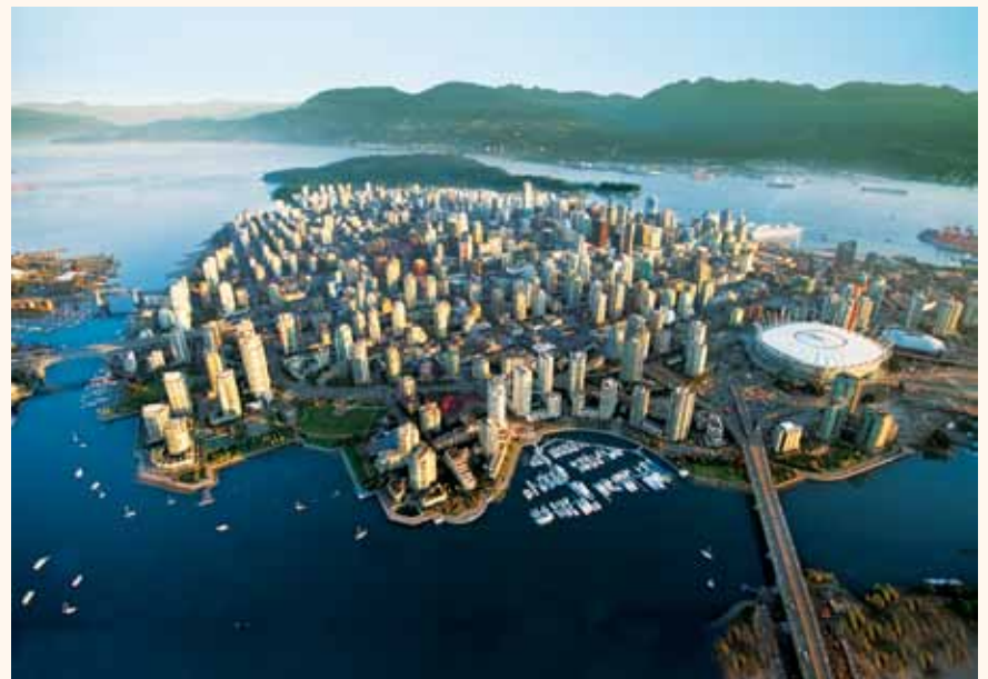
The city of Vancouver and its Vancouver Convention Centre, host site of the Pacific Dental Conference, awaits attendees of the Pacific Dental Conference, from March 6–7.

The exhibit hall promises to be busy with more than 300 companies projected to fill approximately 600 booths. Exhibition hours are 8:30 a.m.