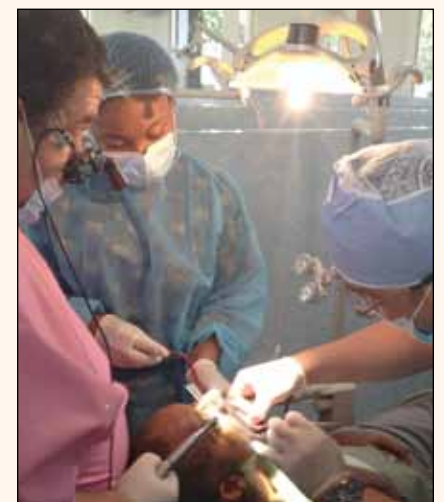
Course participants performing a sinus lift.

Upon completion of the 35-hour comprehensive implant training program, participating clinicians will be able to accomplish the following tasks: identify cases suitable for dental implants; diagnose and treatment plan for pres-