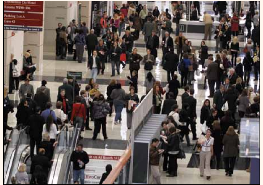
McCormick Place West Building hosts the Chicago Dental Society's Midwinter Meeting, seen here at the 2012 meeting.

Online registration for the meeting at www.cds.org was scheduled to end Feb. 14, after which registration will be available on site. Typically, approximately 3,000 attendees register on site for the meet-