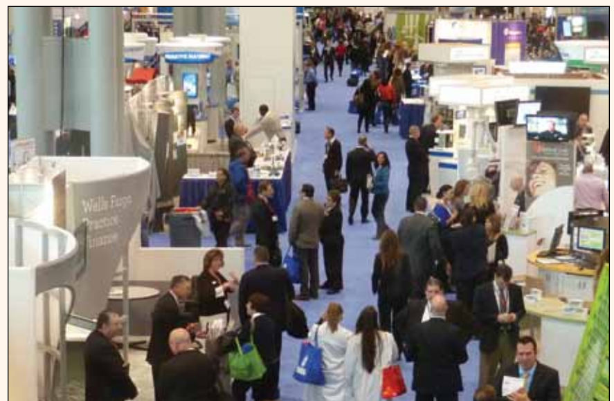
In place for the 2014 Greater New York Dental Meeting: more options on the exhibit floor — anchored by more than 700 exhibitors in 1,700 booths.