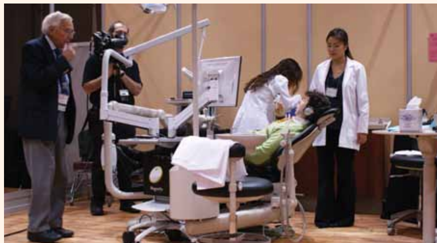
A live dentistry presentation during last year's Greater N.Y. Dental Meeting. Get the full story on the Live Dentistry Arena and what to see and do in NYC.