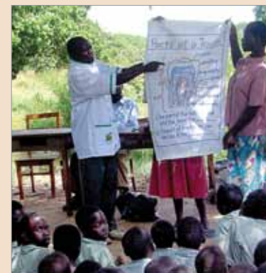
Oral Health lesson in Uganda and other expenses).

The fees of the trip will be £2500 (£1500 to cover individual expenses; £1000 for transport