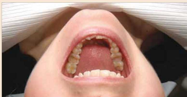
2012 is set to be a challenging year for oral health

UK oral health charity is expecting 2012 to be a challenging year for the nation's oral health as the NHS starts to make savings of £20 billion.