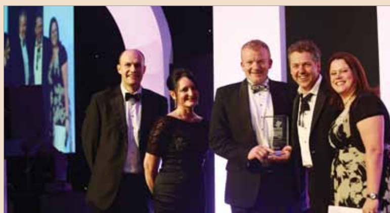
Total Orthodontics directors receive the award