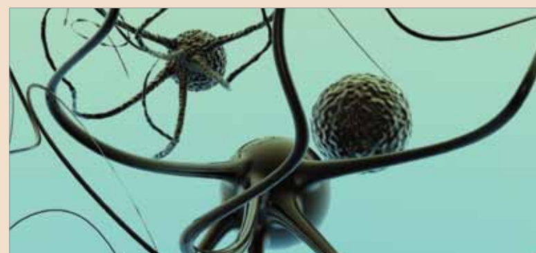
Oral bacteria could be linked to serious health problems

"Simply brushing your teeth for two minutes twice a day using a fluoride toothpaste, cleaning in between teeth daily with interdental brushes or floss, cutting down on how often you have sugary foods and drinks and visiting the