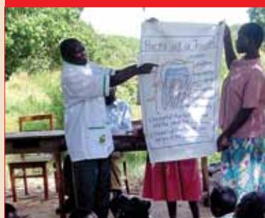
Ugandan expedition Start the year with a mission