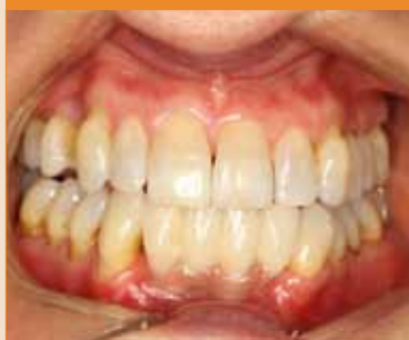
Implant therapy Nilesh Parmar describes treatment planning