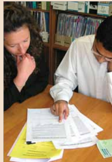
The GDC is pushing for legislative change with regards to handling complaints

The General Dental Council (GDC) is pushing for legislative change to bring in a range of further reforms aimed at streamlining the way it handles complaints about dental professionals.