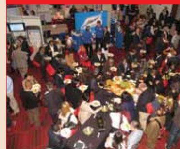
CIC 2012 Preparing for the future