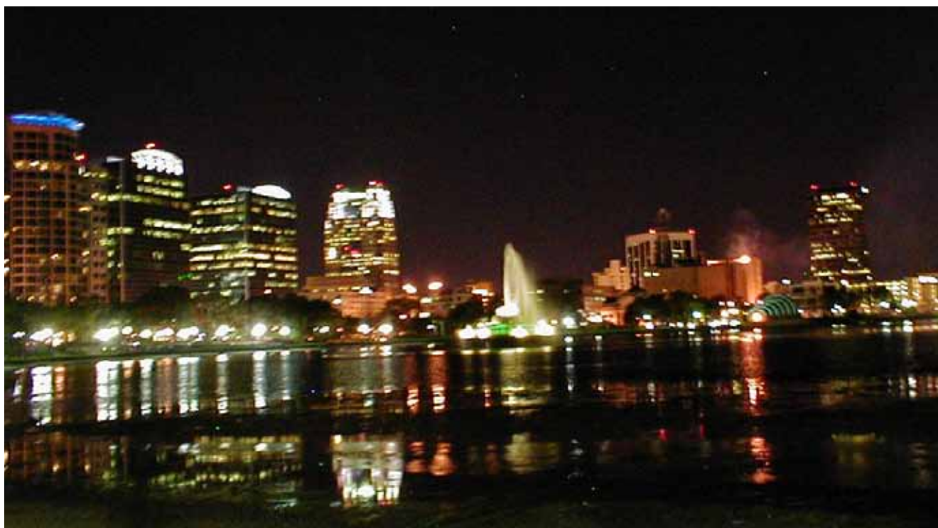
The American Academy of Implant Dentistry will host its 63rd Annual Implant Dentistry Educational Conference beginning Nov. 4 in Orlando, Fla..