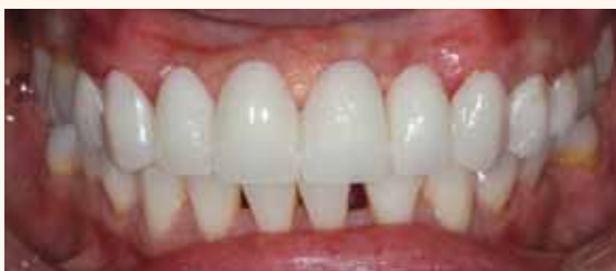
Fig. 5: The BioTemps bridge at delivery, seated with provisional cement.