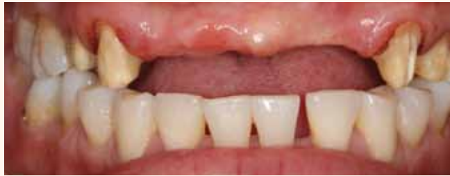
Fig. 2: The original abutment preps are cleaned and reduced to the appropriate margin thickness.