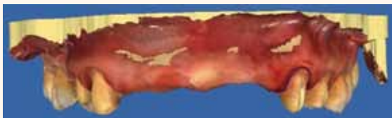
Fig. 4: Labial view of the abutment teeth preparations captured with the CEREC Omnicam. An added benefit of digital impressions is that changes don't require an entire new impression — only a new digital capture of the changed area.