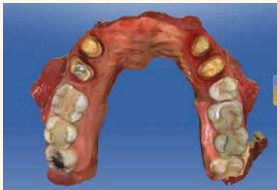
Fig. 3: A digital impression is taken using the CEREC Omnicam (Sirona Dental Systems Inc., Charlotte, N.C.). This occlusal view illustrates how precisely the Omnicam captures a full-color digital impression.