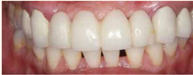
Fig. 1: Preoperative photograph of the patient's existing longspan PFM bridge. Note the bulky and gray margins, unesthetic contours and 'patch' composites used to repair areas of chipped porcelain.