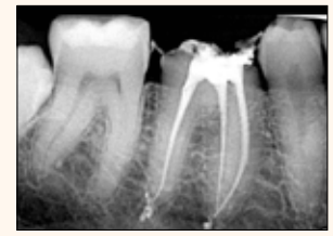
PIPS endo case.

The science of how a laser performs is only one of the considerations that practitioners should focus on when selecting