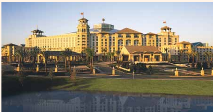
The theme of the Florida Dental Association's annual meeting is intended to place a focus upon all the opportunities that dentists have to influence a patient's overall health. Read on for a taste of what awaits you in the Sunshine State.