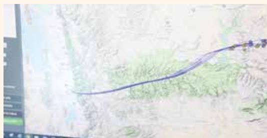
The predicted flight path for the payload