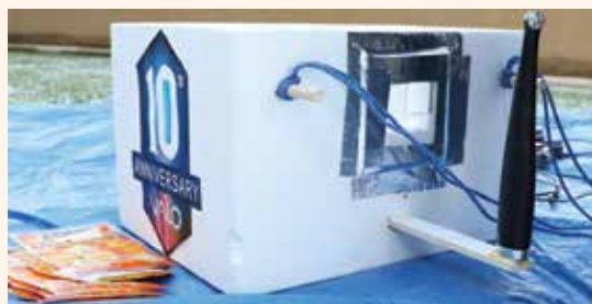
The VALO Light to Space payload box, prior to launch