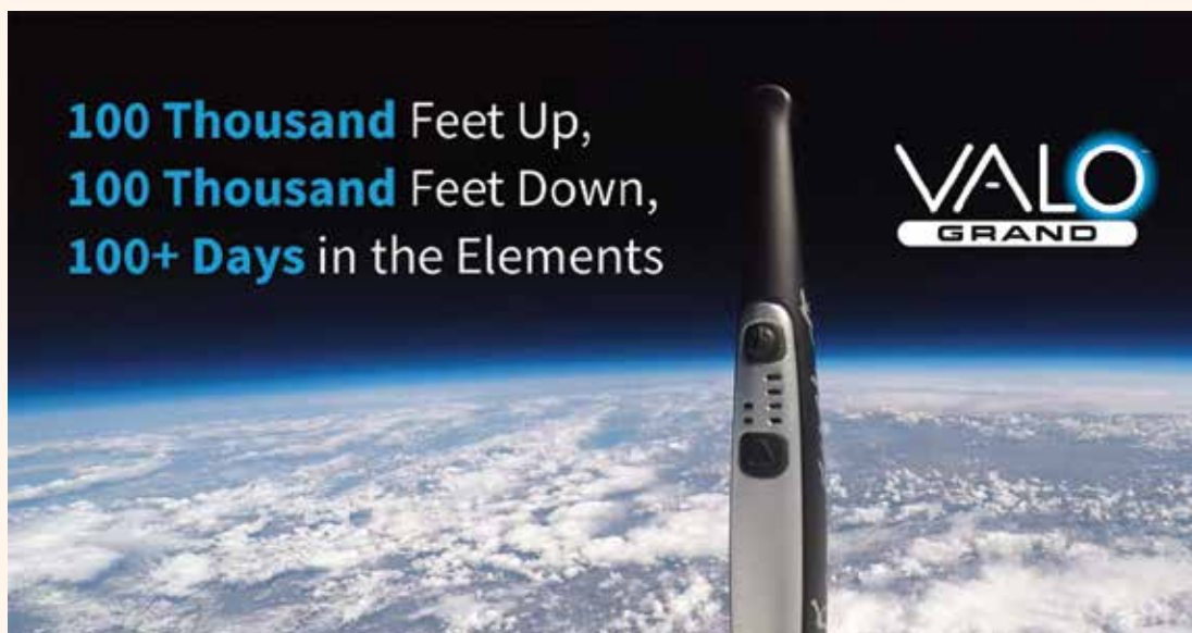
Logo and title excluded, the above is a non-doctored image of a VALO Grand curing light as it ascends through Earth's atmosphere.