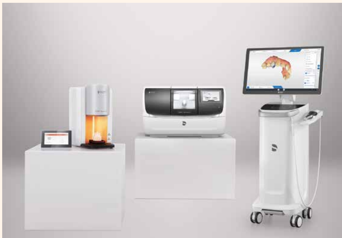
Fig. 3: The renewed CEREC system. CEREC Primemill proves to be a real gamechanger.

For more information on Primemill or CEREC please reach out to your local Dentsply Sirona representative or visit our website www.dentsplysirona.com