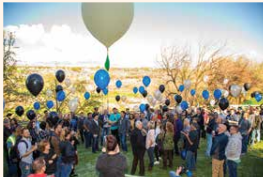
Moments prior to liftoff on Ultradent's lawn