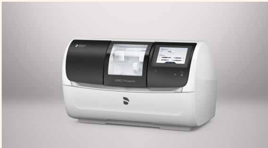
Fig. 1: CEREC Primemill: fast fabricating speed, excellent quality and easy to handle.

With CEREC Primemill, restorations, especially those made of zirconia,