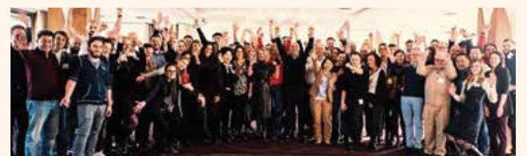
DTI held its 15th Annual Publishers' Meeting from 10-11 March in Cologne.

DTI's CE magazine archive grew to include 50 different titles during the year. CAD/CAM – international magazine of dental laboratories evolved into a magazine dedicated to dental laboratories, and the title digital – international magazine of digital dentistry will focus specifically on the topic of digital dentistry next year.