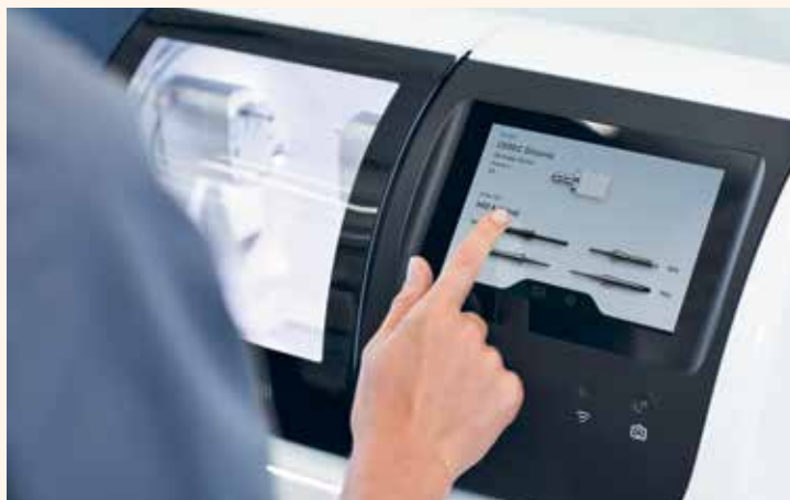
Fig. 2: Familiar usage of the touch interface. Easy and guided processes speed up the workflow.

The entire CEREC system takes on a new dimension with CEREC Primemill. For those customers who now want to step into the chairside CAD/CAM world and want to use CAD/CAM technology in their practice, with the all-new CEREC they get a full system with great flexibility for reliable results. Users who are already successfully using CEREC in their practice will appreciate the system with the new level of speed, high level of quality, and convenience provided by CEREC Primemill.