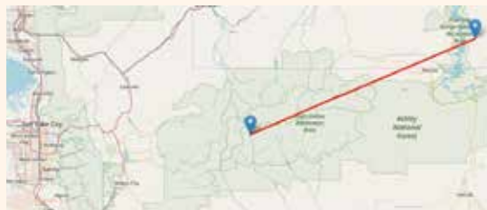
The point on the left marks where the payload landed, roughly 70 miles from the anticipated landing spot of Flaming Gorge Reservoir.