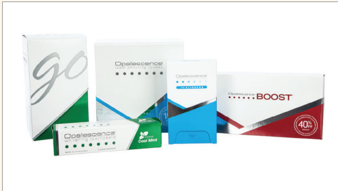
Opalescence PF Whitening for Aligners

Ultradent 505 West Ultradent Drive South Jordan, UT 84095 Web: www.ultradent.com