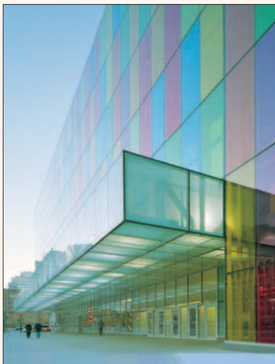
JDIQ is May 27–31 at the Montréal Convention Centre (Palais des congrès de Montréal).

More than 225 exhibitors will span 500 booths in the exhibit hall, which will be open on Monday and Tuesday, May 30 and 31. A continental breakfast will be available to early risers on both days, and a wine and cheese reception will close out each of the two days.