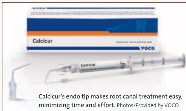
Calcicur's endo tip makes root canal treatment easy, minimizing time and effort.

High pH for anti-microbial effect, promotion of secondary dentin formation