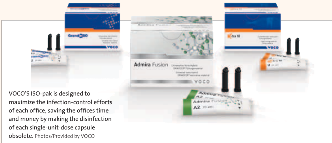
VOCO'S ISO-pak is designed to maximize the infection-control efforts of each office, saving the offices time and money by making the disinfection of each single-unit-dose capsule obsolete.