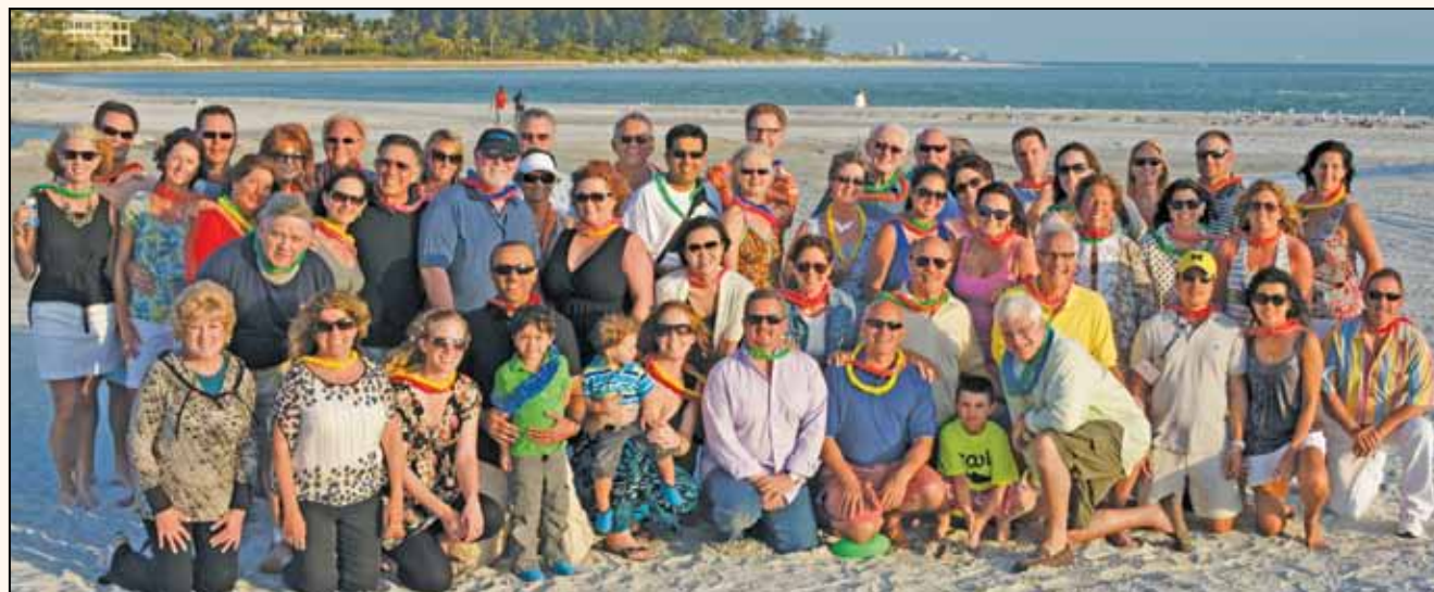
Attendees at the 2013 Smiles In The Sun Seminar, on the beach in Longboat Key, Fla.