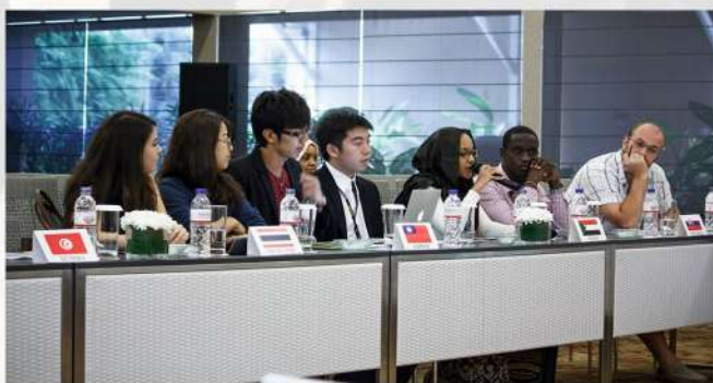
61st IADS & YDW Worldwide Annual Congress - Indonesia - General Assembly 2014

GA is the core event of the IADS meetings. IADS organizes two main meetings every year; Annual Congress (AC), which normally takes place at the end of the summer and Mid-Year Meeting (MYM) at the end of winter/beginning of spring. Usually, two full days of the meeting are reserved for the GA. Members should be informed about the dates of the GA at least 6 weeks prior to the opening session.