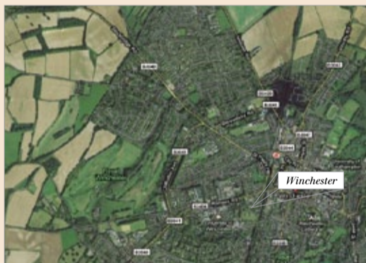
Hope of a new NHS dental surgery in Winchester

"Once the contract is awarded, we will be in a position to make more information available, and then we will start to take the details of people who want to register. In the meantime we would encourage anyone seeking an NHS dentist to check Hampshire Dental Helpline on a regular basis as details of availability across the whole of Hampshire are frequently updated."