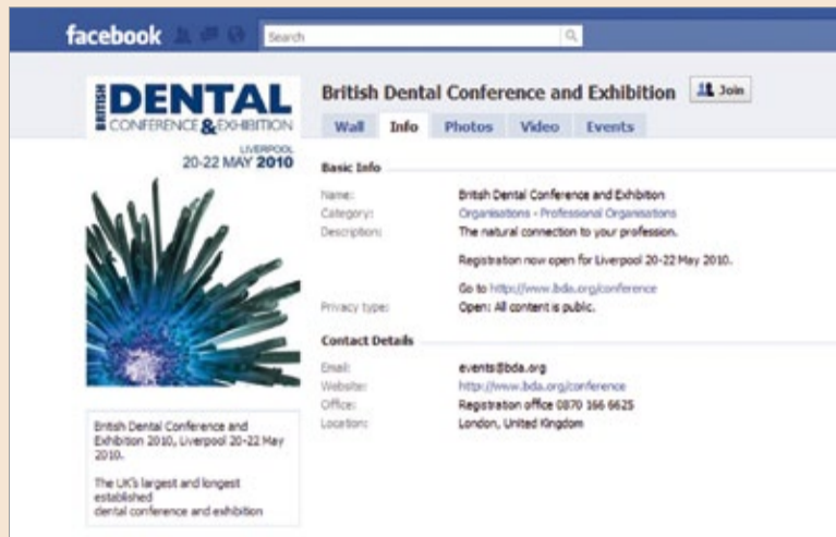
Facebook website with the new group called 'British Dental Conference and Exhibition'