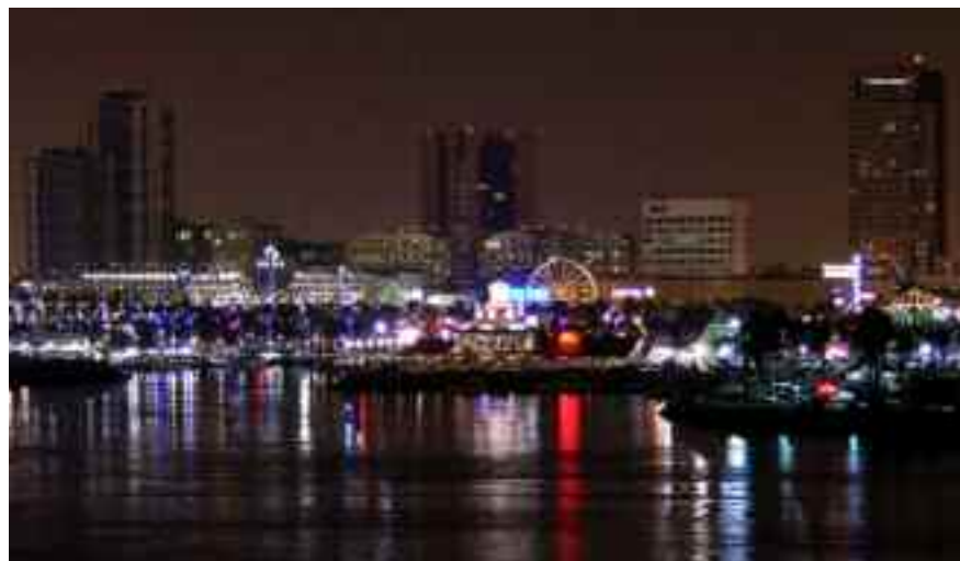
Picturesque San Diego is the site of the Academy of Osseointegration's February meeting.