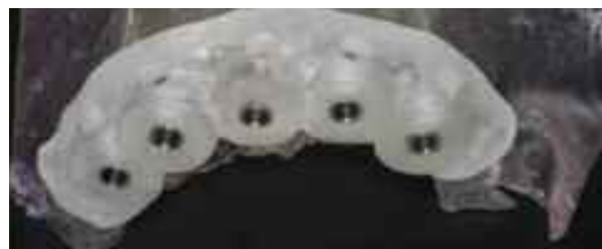
Fig. 7: SimPlant Surgi-guide Bone Supported.

The optimal configuration is four implants placed from mental foreman to foremen (Fig. 8). Four 3.5 mm diameter by 11 mm high are a minimum requirement for the SynCone technique. If 14 mm implants are possible, this is ideal, as most of the early fixation is mechanical in nature. A longer and/or wider