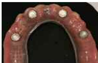
Fig. 3: Horseshoes Flangeless Ovate Pontic Locator retained.