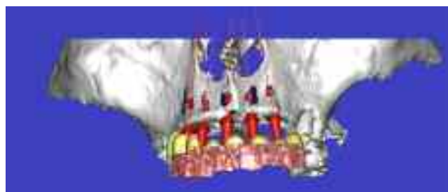
Fig. 6: SimPlant software.