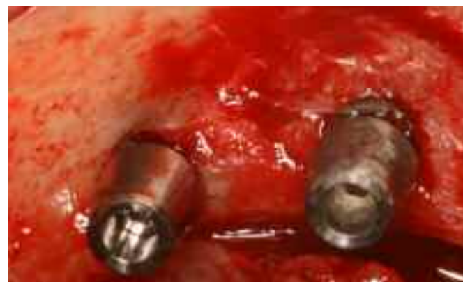
Fig. 5: Place first implant 5 mm anterior to mental foremen.