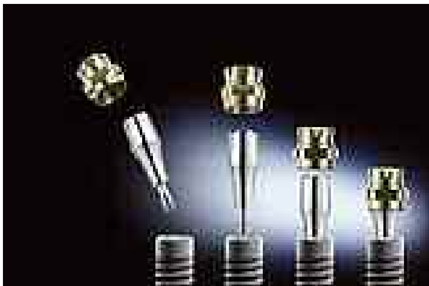
Fig. 1a: SynCone retainers and abutments.