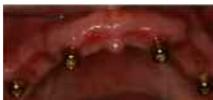
Fig. 2: Locators attachments.