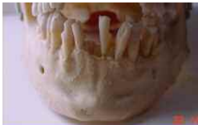
Fig. 4: Cadaver view of mental foremen.

This edentulous 60-year-old female presented with a chief complaint: "I cannot eat; my lower denture moves during function" (Fig. 7a). After bilateral mandibular blocks and localized infiltration, a crestal incision is extended on the edentulous ridge. The residual alveolar ridge is leveled utilizing piezosurgery to create a broad flat ridge to begin the initial osteotomies (Figs. 7b, 7c).