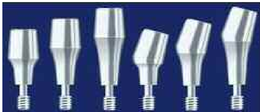
Fig. 1: Syncone abutments.

SynCone has been developed for mandibular dentures with acceptable esthetics, phonetics and vertical dimension to be relined immediately and loaded at implant placement. 1,2,18-21