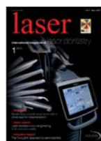
Cover image