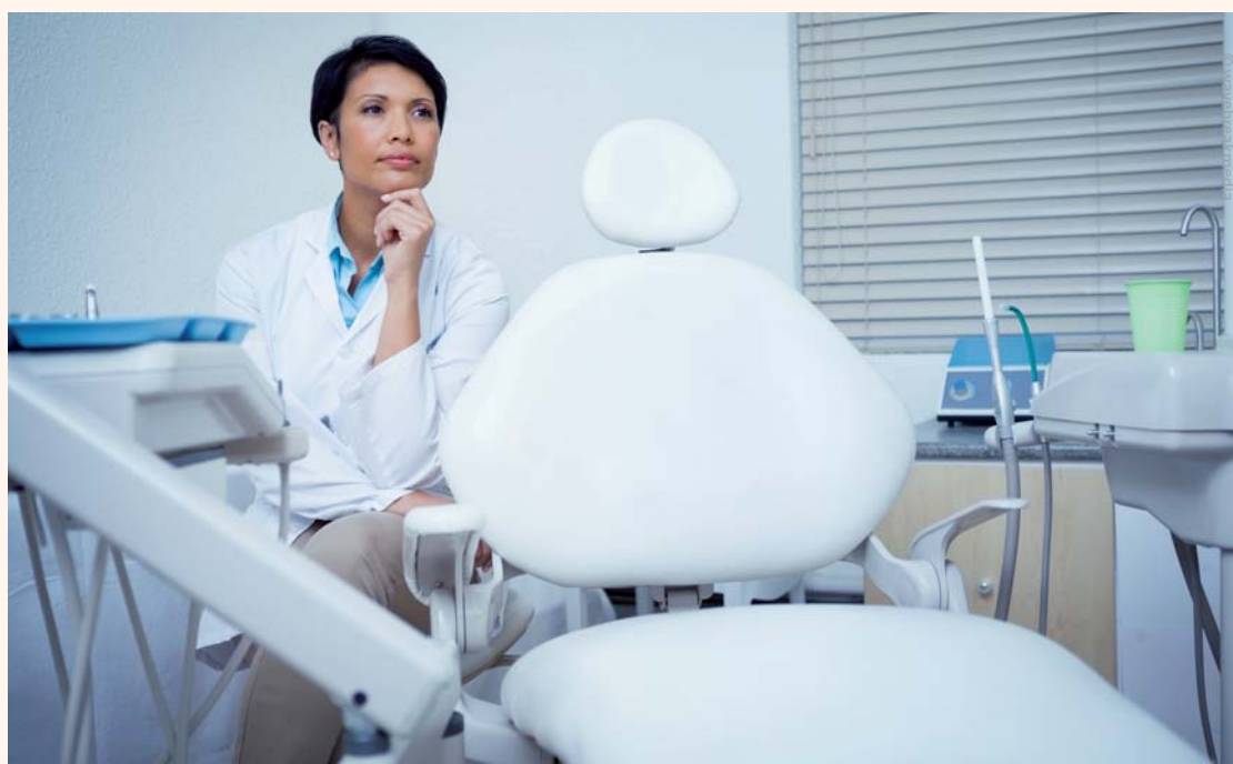
One in two dentist would not recommend dentistry as a career.

"There are huge stresses in the dental profession and great un-