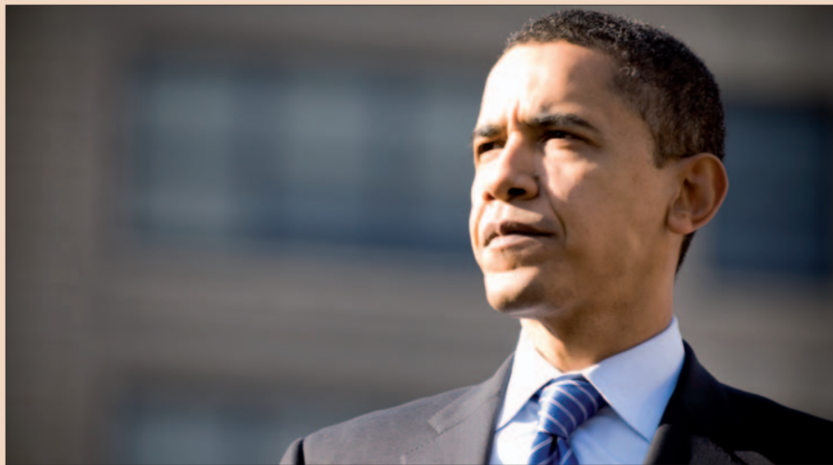
Barack Obama was not dentists' first choice for US presidency

Illinois Senator Barack Obama won the recent US presidential election against John McCain by 365 to 173 votes. He will take office from incumbent president George W. Bush in January next year. In a Democrat radio address in November, he announced the development of a plan that will create 2.5 million jobs by 2011 – “a plan big enough to meet the challenges we face that I intend to sign soon after taking office.” He has also promised to expand federally funded health care for lower income children and other groups.