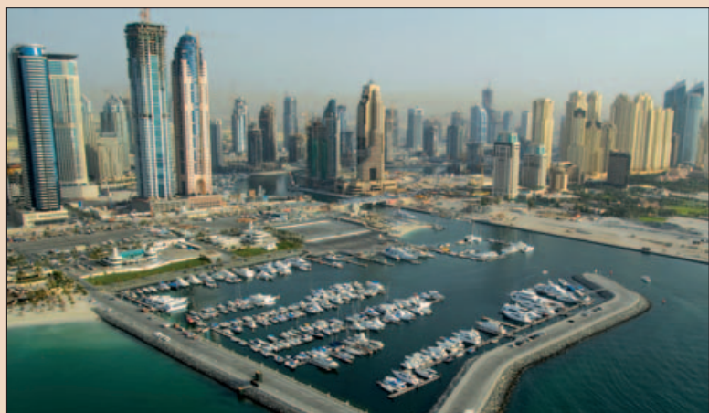
An online information network will connect health facilities in Dubai (picture) and other Emirates until 2011, Photo: haider.

DUBAI, United Arab Emirates: With the implementation of Wareed, the new health information system for the United Arab Emirates, hospitals and clinics in the country will be connected via an online network by 2011 to improve medical care and ensure patient safety, a Ministry of Health official told Dental Tribune in November.