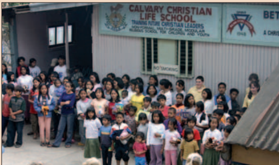
Christian school in the Philippines

The Philippines is one of the Third World countries with the most alarming child dental problems. According to the Department of Education's recent National Oral Health Survey of six- and twelve-