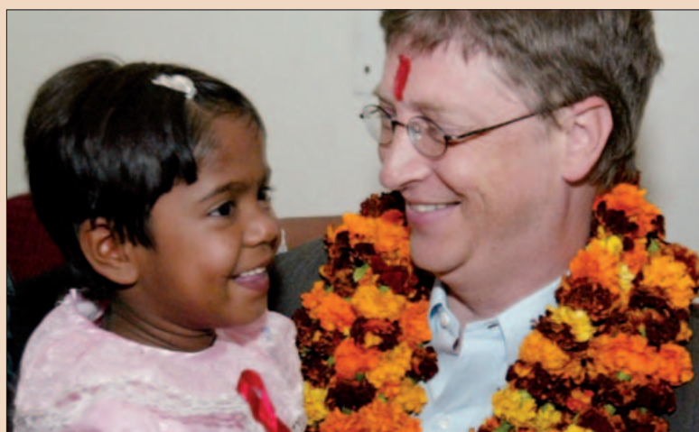
Bill Gates has warned rich countries to cut back spending on health aid. Here he holds a child during a visit to India in September 2000. ► NEWS, page 5