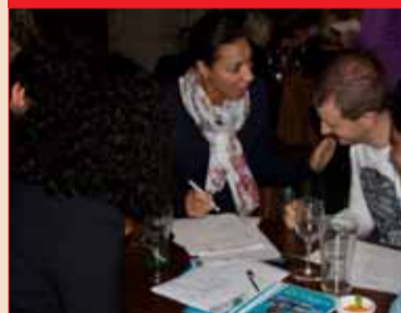
BACD Charity mission for 2013