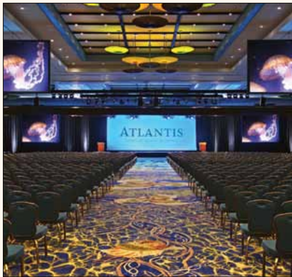
The Summers in Paradise conference will be at the Atlantis Resort in the Bahamas this summer. The conference is being presented by Paradise Dental Institute, www.paradisedentalinstitute.com, (844) 229 - 7192.