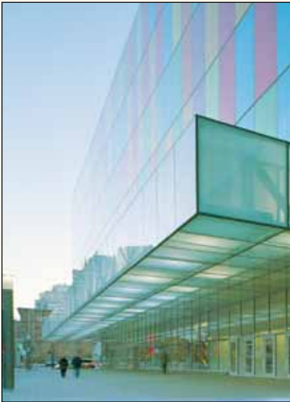
JDIQ is May 22–26 at the Montréal Convention Centre (Palais des congrès de Montréal).