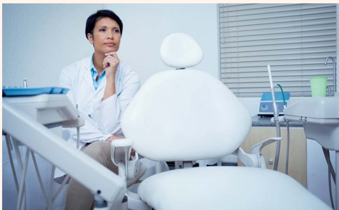
One in two dentists would not recommend dentistry as a career.

"There are huge stresses in the dental profession and great un-