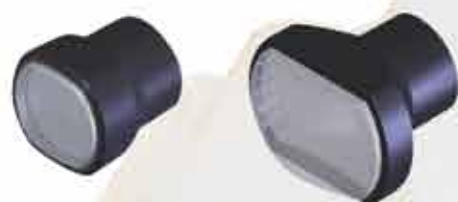
NEW Micro2.5x Scopes™