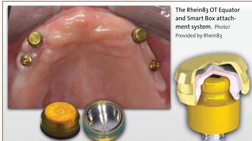
The Rhein83 OT Equator and Smart Box attachment system.