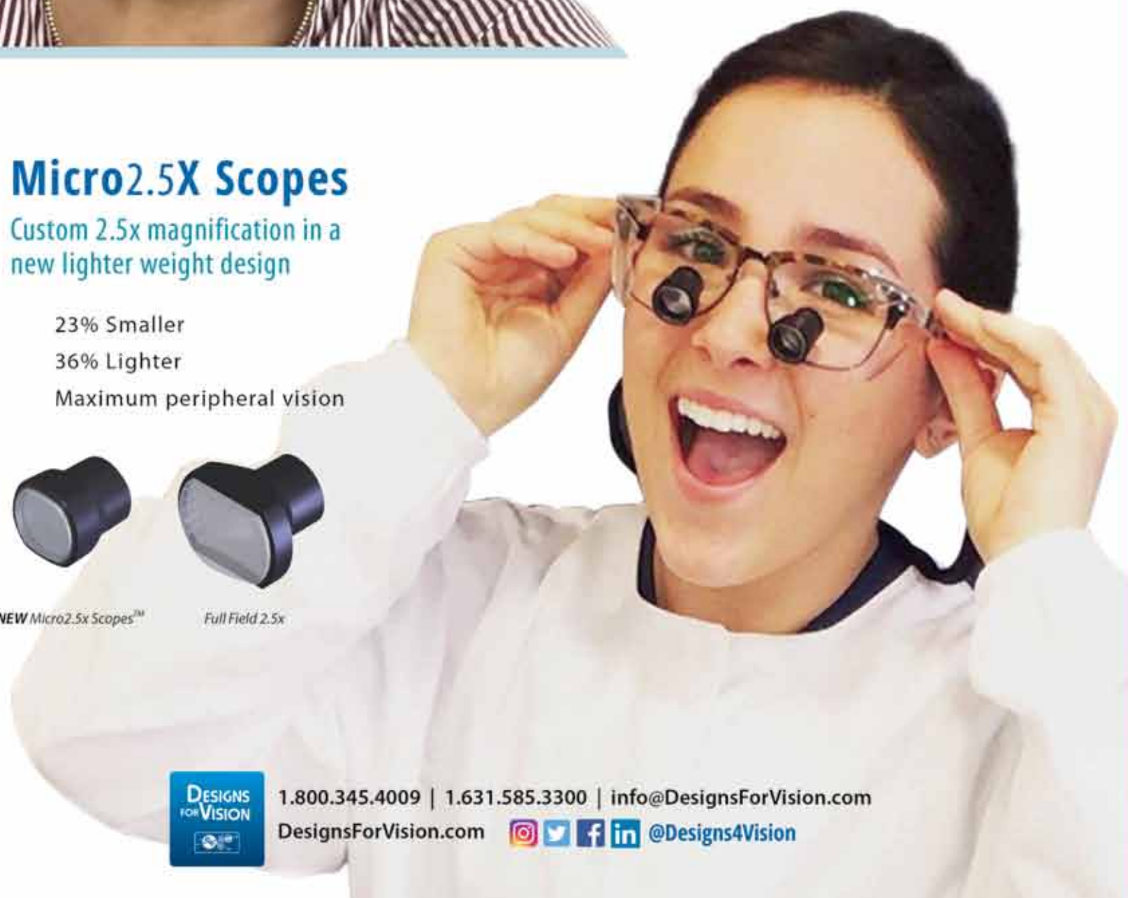
Full Field 2.5x