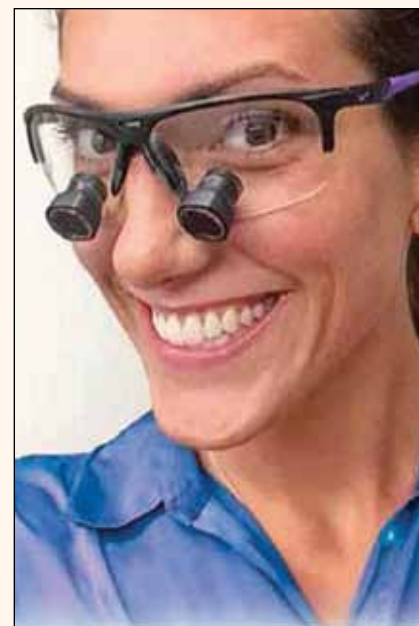
Left, the WireLess Mini headlight is powered by specialty rechargeable lithium-ion rechargeable cylindrical cells, and it comes complete with three batteries. Right, the Micro 2.5x loupes weigh as little as 1.2 ounces.