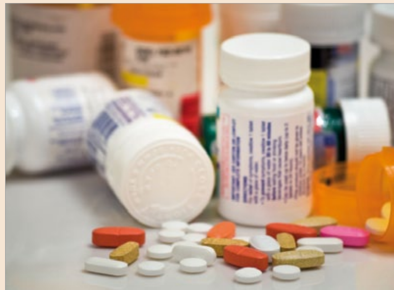
Counterfeit medicines have been supplied to both UK and international customers

"What we seized yesterday is estimated to have a street value of more than £1 million but the business these men were running could have generated a turnover well in excess of that." DT