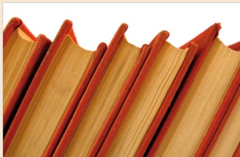
The archive will provide an essential record of the evolution of the dental profession

The project will comprise a series of witness seminars and individual oral history interviews, encompassing the full breadth of dentistry in the UK. DT