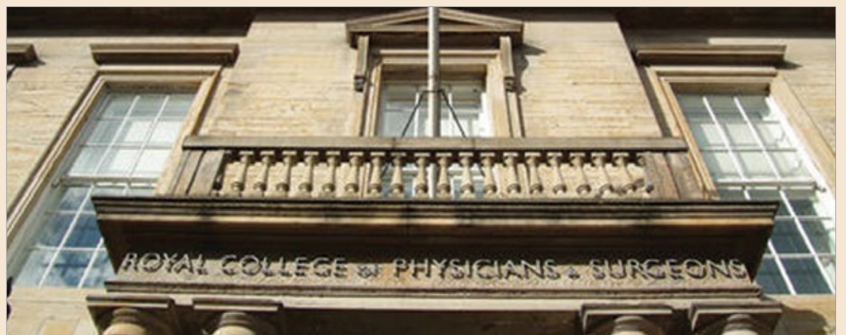
The Royal College of Physicians and Surgeons of Glasgow