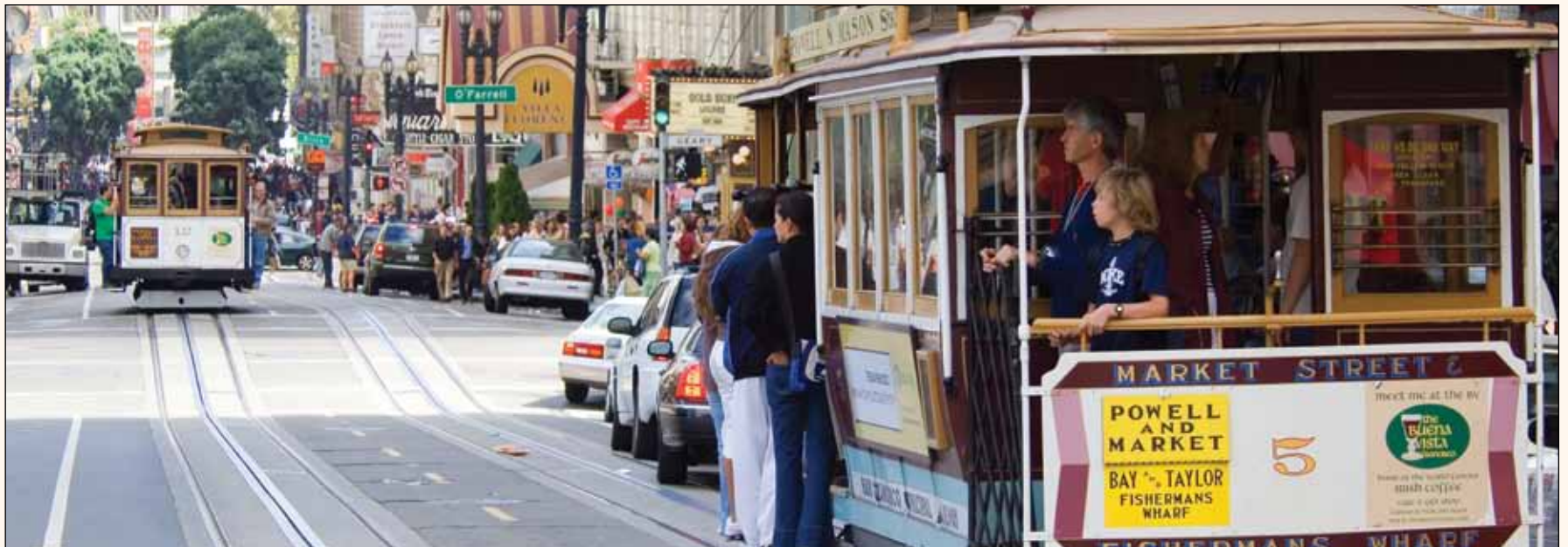
The iconic sights and sounds of San Francisco, including the world's only manually operated cable car system still running in a metro area, await attendees of CDA Presents The Art and Science of Dentistry, scheduled for Aug. 15–17 at the Moscone South Convention Center.