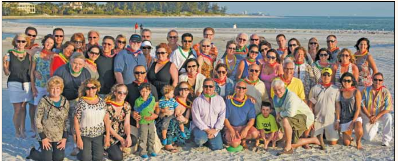
Attendees at the 2013 Smiles In The Sun Seminar, on the beach in Longboat Key, Fla.