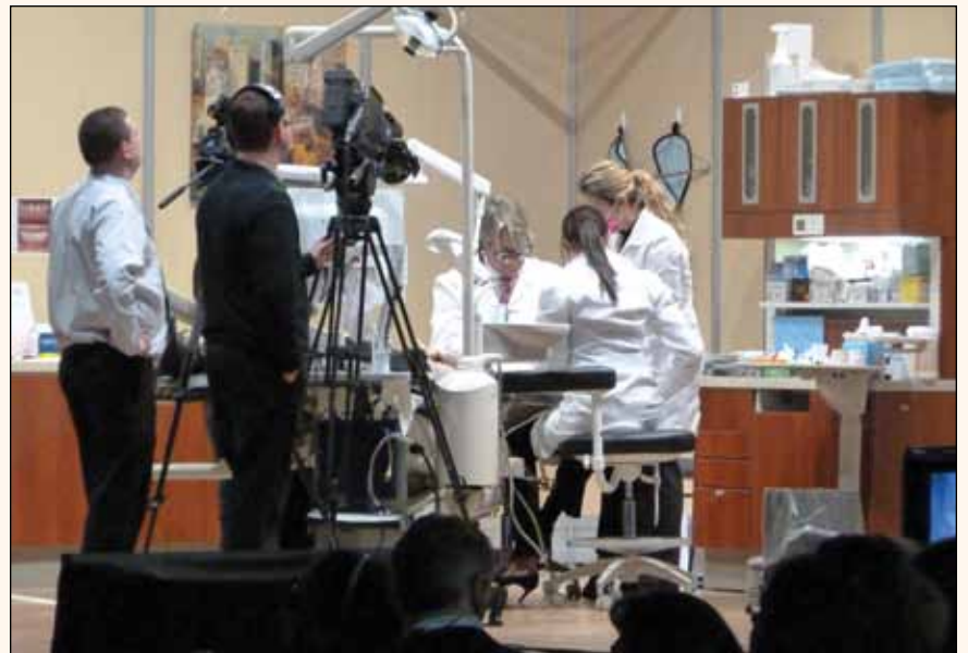
Four days of live dentistry in the exhibit hall are among the many highlights of the diverse educational opportunities at the Greater New York Dental Meeting.

The GNYDM is the largest dental congress and exhibition in the United States, registering 53,481 attendees from all 50 states and 130 countries in 2012.