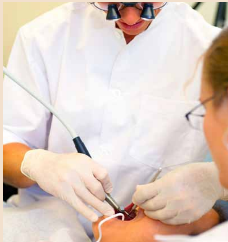
Graduates can work in a variety of practices

Anyone interested in applying for the Regional Dentist Programme can contact the IDH resourcing team online or on 0845 647 7364. DT