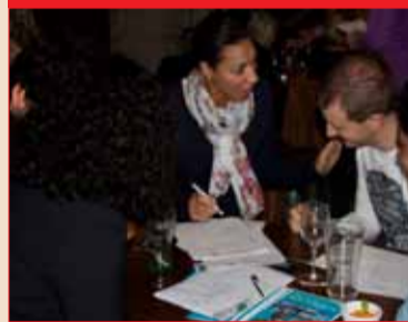
BACD Charity mission for 2013