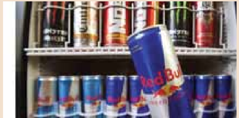
Energy drink consumption has doubled in the US

use of energy drinks by explaining that perceived health benefits are largely due to marketing techniques rather than scientific evidence. Because of the drinks' widespread use, it may be beneficial for Emergency Department staff to inquire about use of energy drinks when assessing each patient's use of medications or other drugs." DT