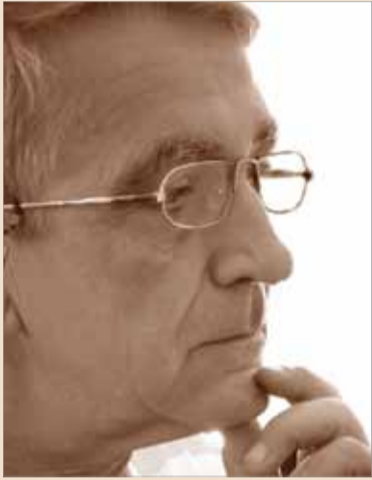
Too much tooth loss makes you go blind?

Results of the study published in the Journal of Periodontology reveal