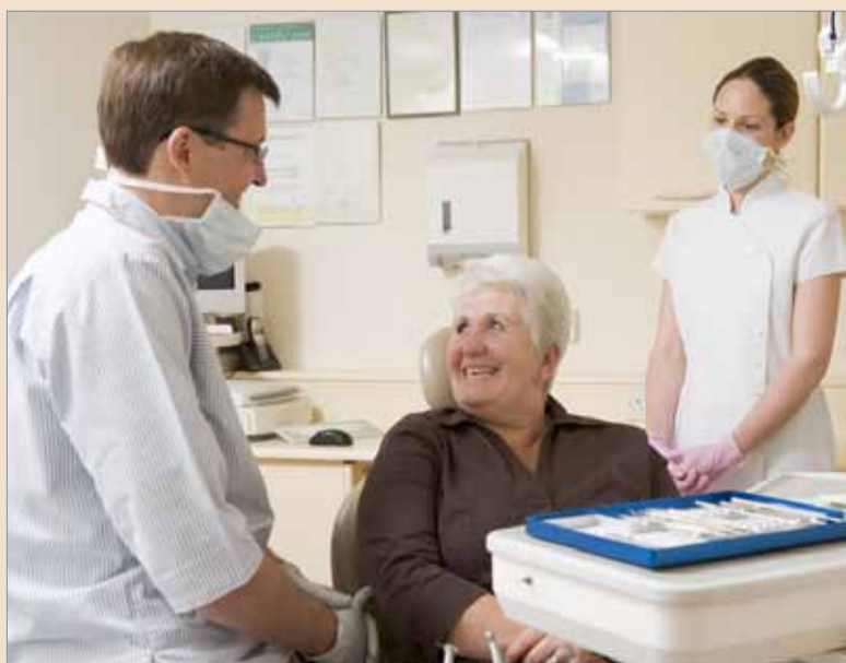
Pilot sites will trial new self-care plan

Dental practices across the country are preparing for an exciting new challenge as the shortlist of those chosen to continue shaping a new dental contract