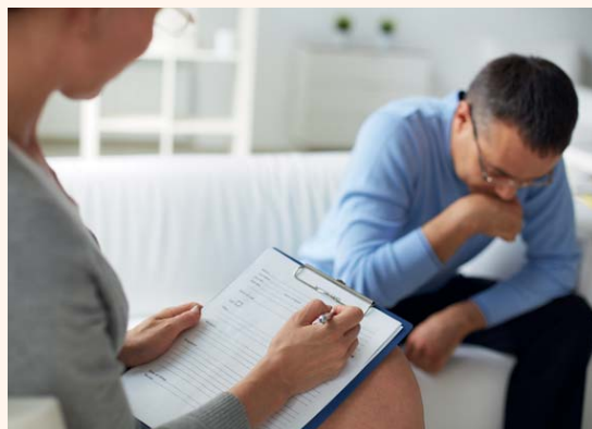
With CBT a therapist aims to help patients change their feelings and behaviours by restructuring their thinking and breaking negative thought cycles.

"Our study shows that after on average five CBT sessions, most people can go on to be treated by the dentist without the need to be