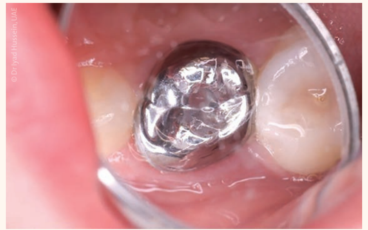
Photo showing a preformed metal crown fitted with the Hall technique.

"Crowns are recommended for restoring primary molars that have had a pulp treatment, are very decayed or are badly broken down.