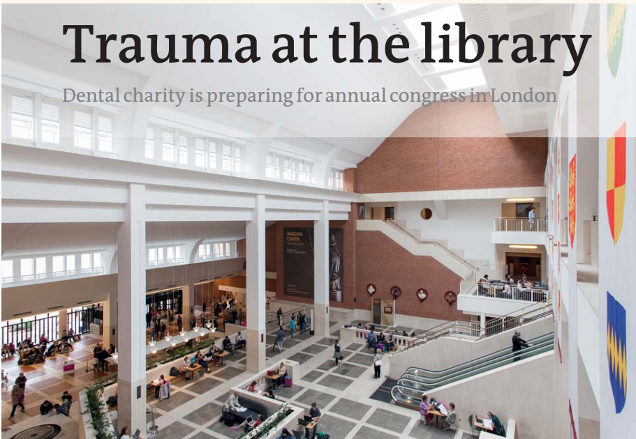
The British Library will host the annual congress of Dental Trauma UK again.

Dental charity is preparing for annual congress in London