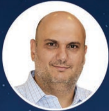
Antonis Chaniotis Greece