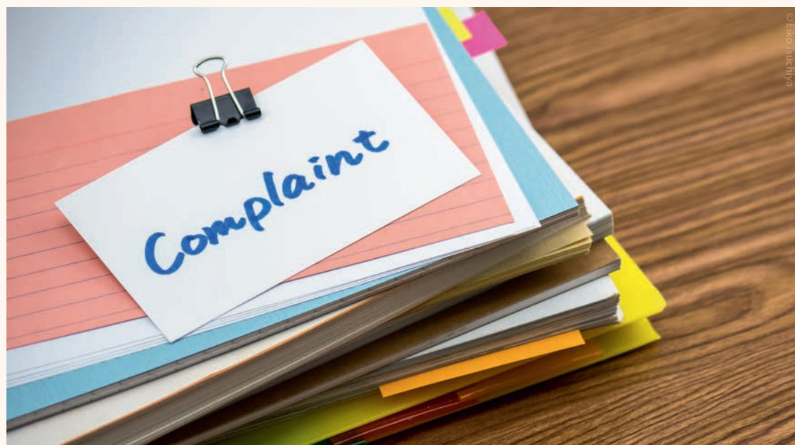
By reducing the number of cases heard by the regulatory body, the GDC hopes to save £1.8 million per year.