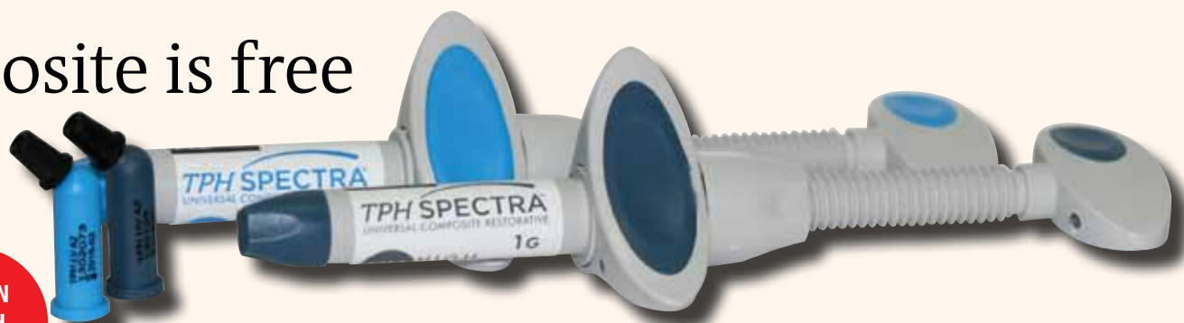
Just-released TPH Spectra Universal Composite comes in seven VITA-based shades in either LV (Low Viscosity) or HV (High Viscosity).