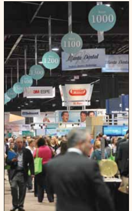
Expect nearly 400 companies in the exhibit hall; and new this year on the exhibit floor is a vintage car show.

presentation on Friday, March 22, on timeless principles.