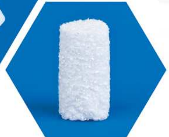
Bone Graft Putty Mineral-Collagen Composite

The Newport Biologics™ line of bone grafting materials and resorbable barrier membranes represents the highest quality of regenerative products available. By assembling only the most versatile, effective and frequently used regenerative materials the industry has to offer, we provide clinicians a simplified buying experience, unparalleled value, and the confidence to efficiently and reliably treat the majority of grafting indications.