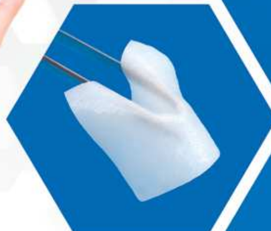
Resorbable Collagen Membrane 3-4