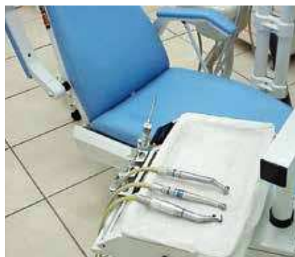
AO session aims to help young clinicians avoid implant complications.

Another takeaway will be that zirconia is a great material being used more and more in the profession because of its broad range of advantages and indica-