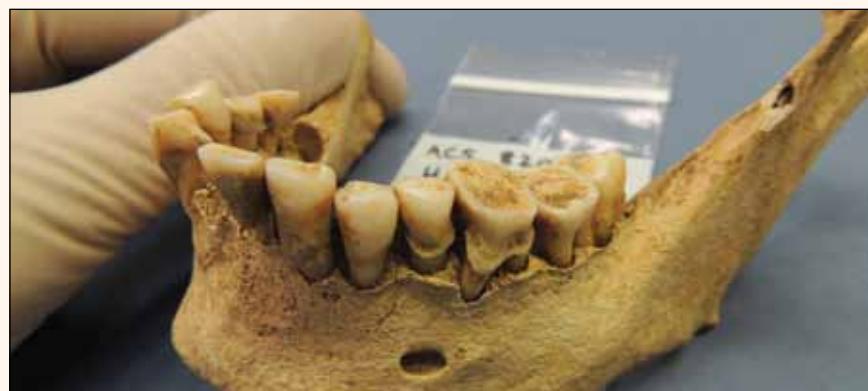
Teeth of late Iron Age/Roman adult female, recovered near Cambridge, United Kingdom, show large dental calculus deposits, which researchers describe as the only easily accessible source of preserved human bacteria.

Adler wrote, "One common cause of gum disease, porphyromonas gingivalis, had been suggested to lie behind recent rises in heart disease. However, we were able to show it had not increased in prevalence over the past 7,000 years, sug-