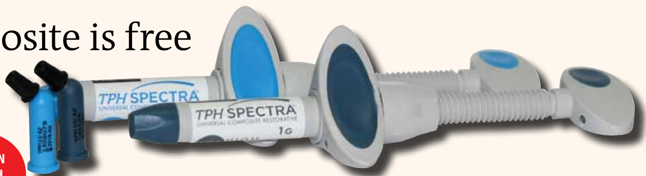
Just-released TPH Spectra Universal Composite comes in seven VITA-based shades in either LV (Low Viscosity) or HV (High Viscosity).

techniques" required to overcome handling obstacles associated with many composites.