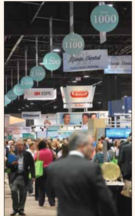
Expect nearly 400 companies in the exhibit hall; and new this year on the exhibit floor is a vintage car show.

presentation on Friday, March 22, on timeless principles.