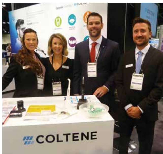
• The team at Coltene can help you find just what you need at booth No. 2250.