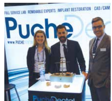
• Be sure to see the Puche Dental team at the booth, No. 590, where you can also check out Solvay's Uitraire AKP.