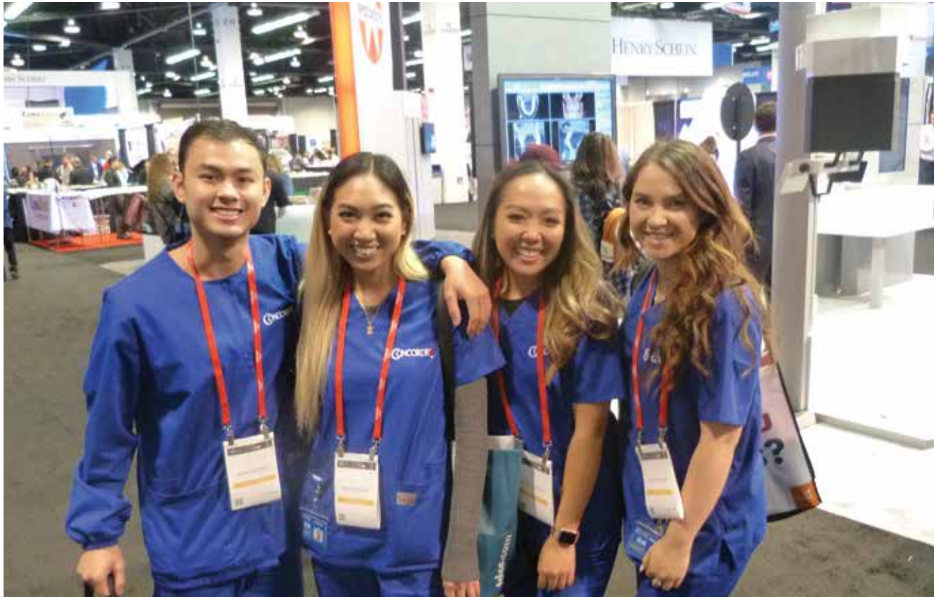
• Concord Career College, Garden Grove, students in the dental assistant program enjoy checking out the hundreds of CDA exhibit hall booths on Thursday.