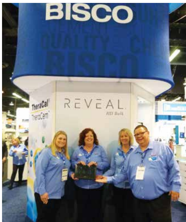
• The team at Bisco stands ready to 'Reveal' its new light-cured bulk fill restorative composite at booth No. 400.