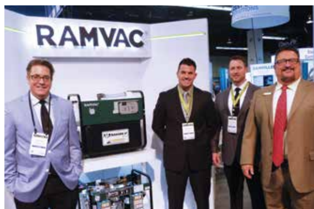
• The DentalEZ team is ready to introduce you to the RAMVAC at booth No. 416.