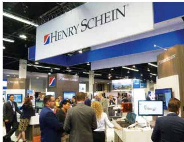
• The Henry Schein booth, No. 1362, has a wide variety of in-booth presentations and demonstrations you won't want to miss.