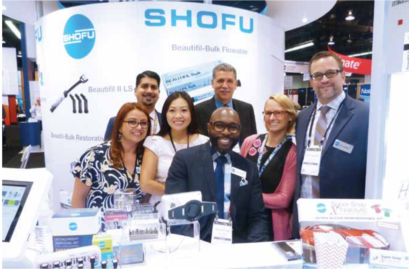
• Be sure to visit the team at Shofu Dental, No. 1128, who stand ready to answer all your questions.