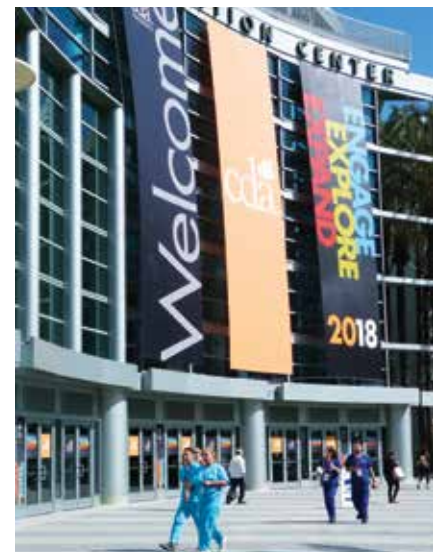
• Attendees stream into the first day of the CDA annual session in Anaheim, Calif.