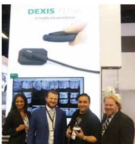
• Be sure to ask about the new DEXVoice hands-free option at Dexis, booth No. 1535.