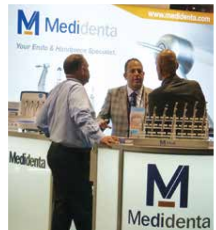
• Stop by the Medidenta booth, No. 1733, to ask about CDC bundles, free offers and big discounts on burs.