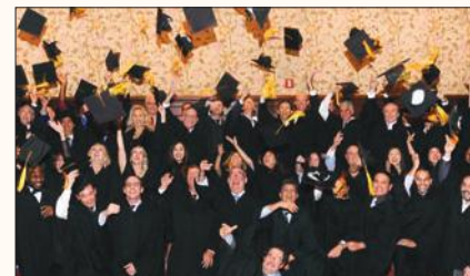
The traditional tossing of mortar boards celebrates newly conferred IADFE fellowships.

This year's fellowships will be awarded at the iconic Sanford-White-designed Harmonie Club at 4 East 60th St. (between Madison and Park avenues). Beginning at 6 p.m., fellowships will be presented to new members from across the globe, including Australia, New Zealand, France,