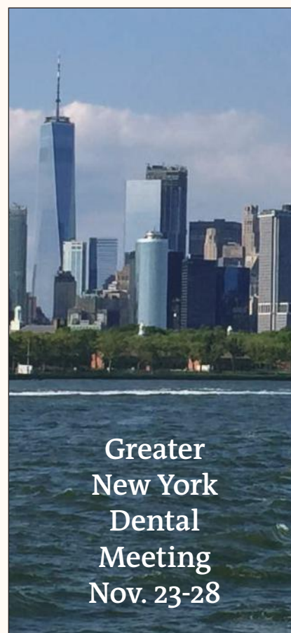
The 'World Capital of Excitement,' New York City — during its most enchanting time of the year — serves as the backdrop to the Greater New York Dental Meeting.

It all takes place in the "World Capital of Excitement" with its nonstop cultural, sporting and social events during the peak holiday season that many view as New York City's most enchanting time of the year. You can register and get all of the details at www.gnydm.com .