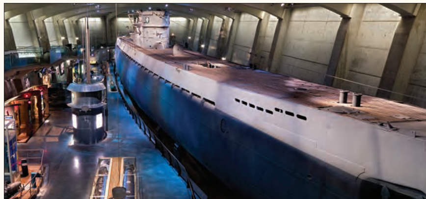
The AAPD 2019 Welcome Reception at Chicago's famed Museum of Science and Industry will feature emersive exhibits open to attendees, including the chance to tour a German U-505 submarine captured during World War II.