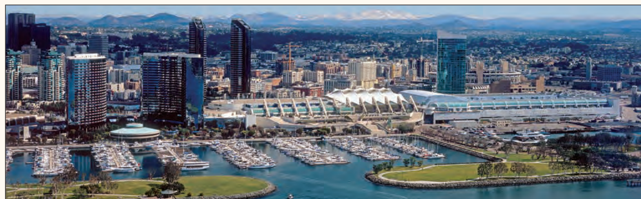
The San Diego Convention Center, on the city's waterfront and a short stroll away from the city's popular Gaslamp Quarter, is host site of the American Academy of Cosmetic Dentistry 2019 annual scientific session, April 24–27.