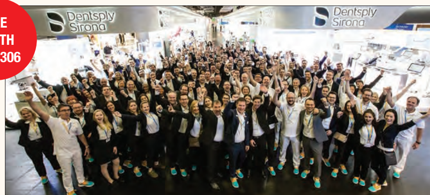
The Dentsply Sirona team at IDS 2019.

level of interest. The self-adhesive restoration material combines the simplicity of a glass ionomer with the stability of a conventional composite and has good esthetic properties. This allows a cavity to be treated in just one layer without retentive preparation, making the entire treatment process four steps shorter (and about seven minutes quicker).