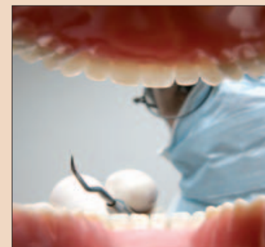
Lincoln patients are set to benefit with NHS dentistry

The challenge now is to get the message across to residents that dental access has greatly improved, with regard to NHS dentistry in the locality.