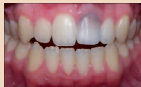
Tooth-whitening is one of the FGDP's aesthetic dentistry masterclasses.

Members of FGDP (UK) get a 10 per cent discount when purchasing all five modules.