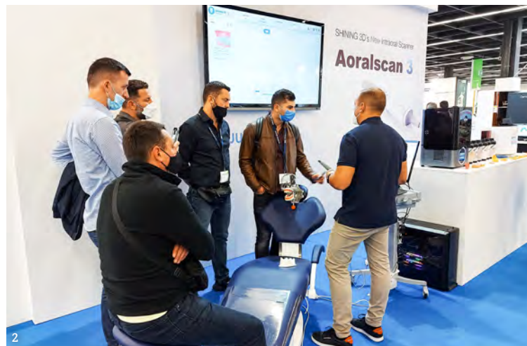
2 Digital dentistry specialist SHINING 3D demonstrated its new Aoralscan 3 intra-oral scanner at the recent International Dental Show in Cologne. – 3 SHINING 3D said that IDS visitors were impressed with the Aoralscan 3—in particular with its scanning speed and the precision of the data collected.

The first thing that I would say is that we can think about these two