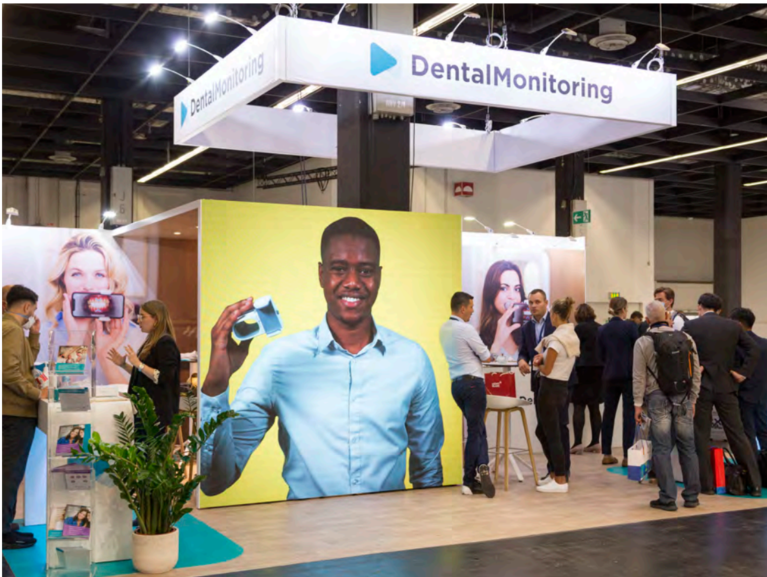
▲ Integration of artificial intelligence has accelerated in the dental industry.