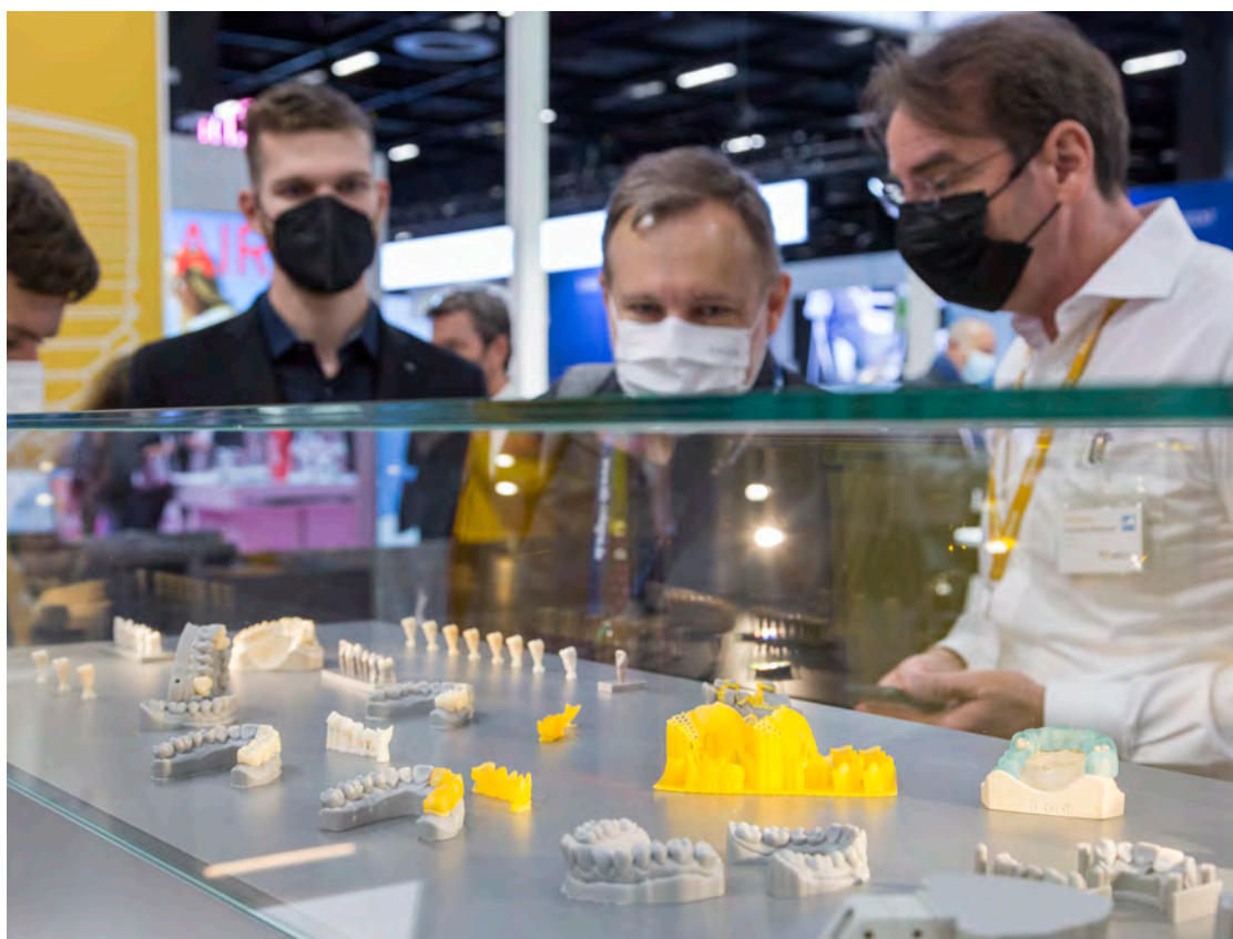
▲ 3D printing has become one of the major trends in dental technology.