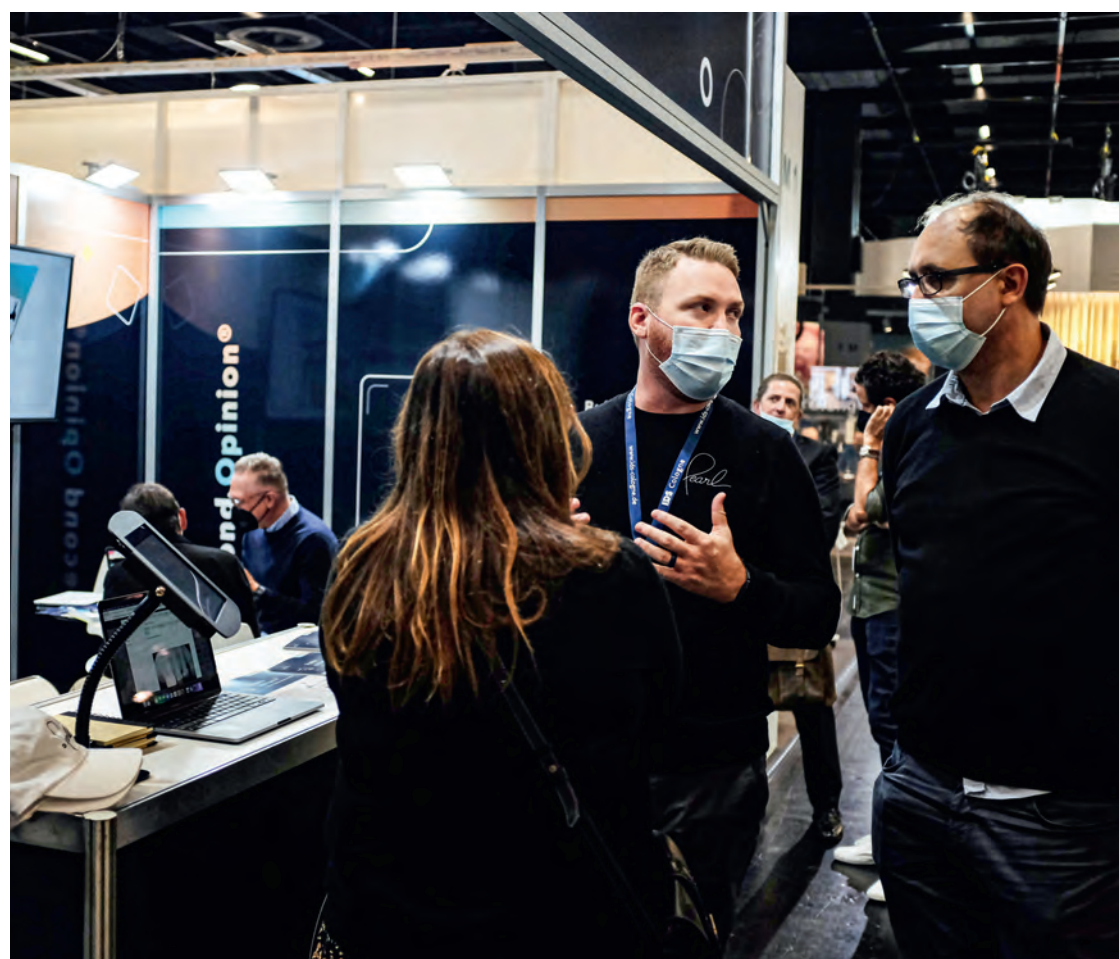
▲ Pearl announced at IDS 2021 that its Second Opinion AI solution is now commercially available in Europe.

Raw data, yes. You have to employ experts to annotate the data,