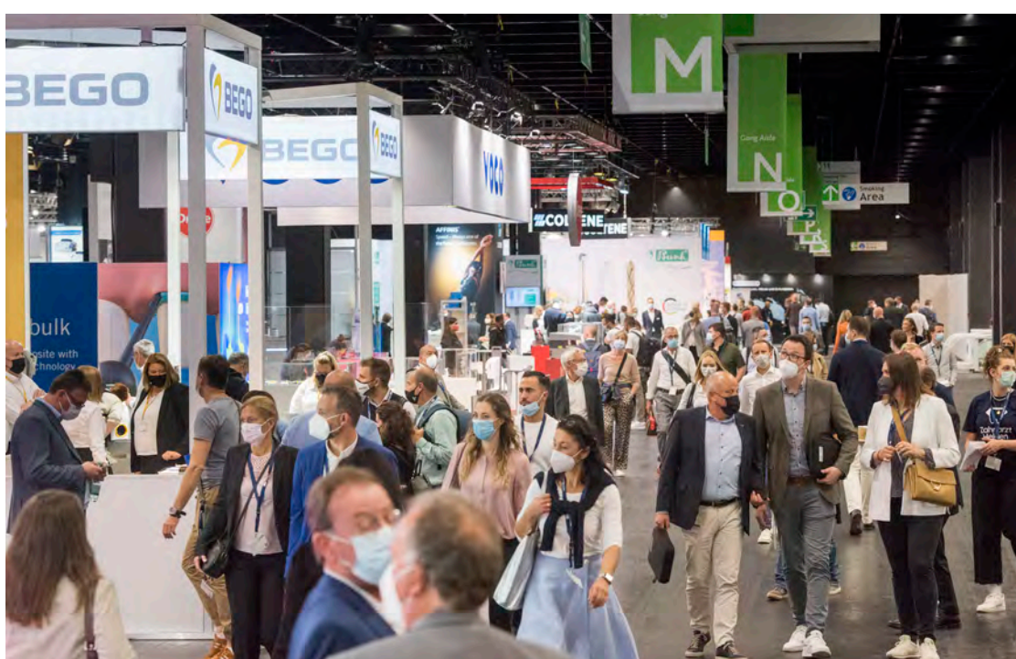
▲ More than 23,000 trade show visitors from 114 countries attended IDS 2021, around 57% of whom came from abroad.

Digital technology, such as remote care digital tools, intra-oral scanners, 3D diagnostics, CAD/CAM, radiography, CT and other imaging techniques, is playing an increasingly