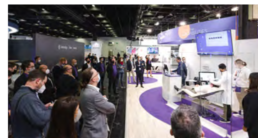
▶ IDS visitors had the opportunity to watch a number of live demonstrations at the exocad booth.