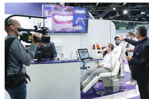
▶ For dental professional, who were unable to attend IDS in person, exocad offered live streamings during the show.

The joint platform with exocad DentalCAD, the world's leading CAD laboratory software, also unlocks unimagined possibilities for digital collaboration with tens of thousands of laboratories. More information can be found at https://exocad.com/ids . ◀