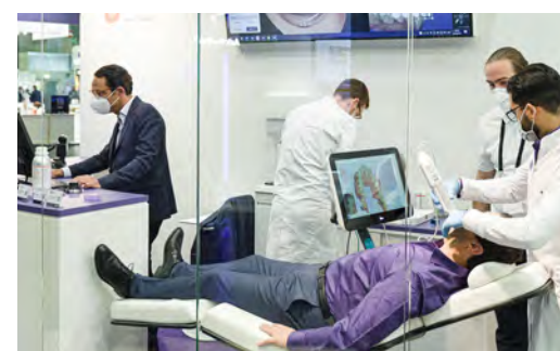
▶ At this year's IDS, exocad announced the release of ChairsideCAD 3.0 Galway, the next generation of its easy-to-use CAD software for single-visit dentistry.