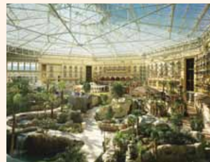
One of the Gaylord Palms' signature atriums.

make new ones. From the Welcome Reception to the Party in Paradise, networking opportunities abound.