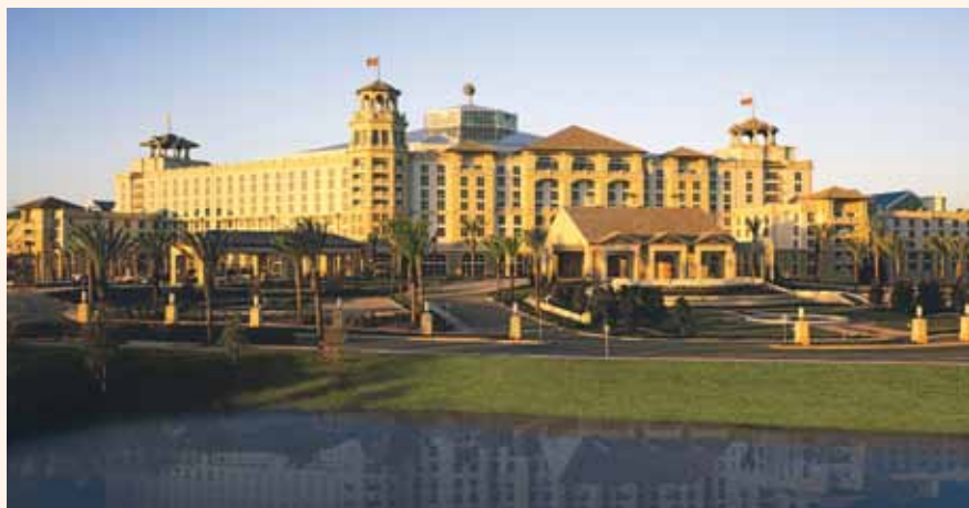
The theme of the Florida Dental Association's annual meeting is intended to place a focus upon all the opportunities that dentists have to influence a patient's overall health. Read on for a taste of what awaits you in the Sunshine State.