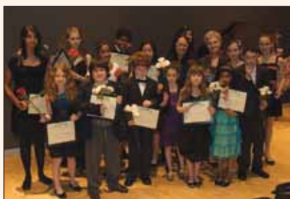
YM Studio students hold their certificates of recognition for participating in the Young Musicians for a Smoke Free Planet benefit concert in New York on April 27.