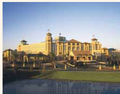
The Gaylord Palms Resort and Convention Center.

Another benefit of attending FNDC2011 is the networking opportunities. Throughout the meeting, there are many opportunities to reconnect with old friends and