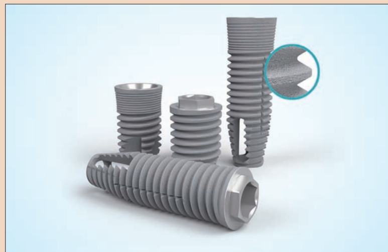
The new functional hybrid dental implants will be distributed by Zimmer Dental in select markets.

Exopro started as a development corporation in 1988 in Sweden, evolving into a leading dental implant company owing to its research-based endeavours. Under the philosophic principles of Brånemark, its aim is to create high-performance, simple, safe and versatile solutions for patients and professionals. DT