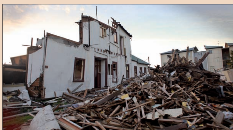
Earthquake-damaged buildings in Christchurch, New Zealand. The devastations caused by the disaster in 2011 also had an effect on the dental infrastructure. NZDA's Donna Batchelor explains. ▶ ASIA NEWS, page 2

The new figures significantly differ from earlier predictions that estimated the market value to reach only US$14-15 billion in the same period. The reasons for this increase are the rising awareness in developing nations about oral hygiene as well as new product developments in the consumables sector, the report states. Higher income levels and insurance coverage in emerging markets like India and China are also expected to contribute significantly to the growth of the market. DTI