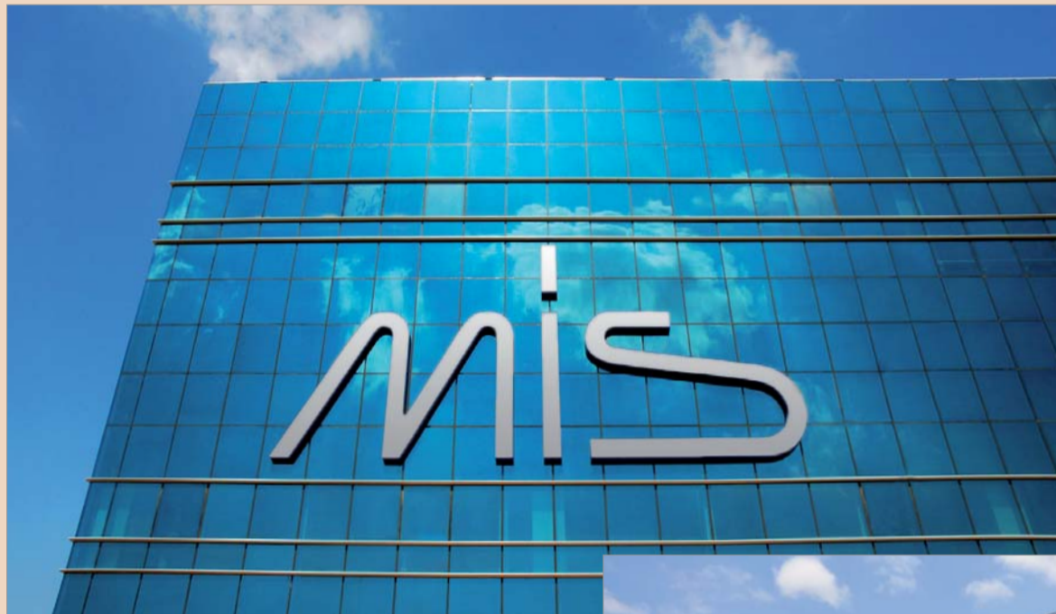
MIS headquarters

In 2009, MIS moved operations to a large purpose-built production complex located in a new high-tech industrial park in northern Israel. “Our location adds to our uniqueness. Israel is a country of high innovation and offers particularly favourable conditions for manufacturing, because of the quality of education and people’s high levels of motivation. Furthermore,