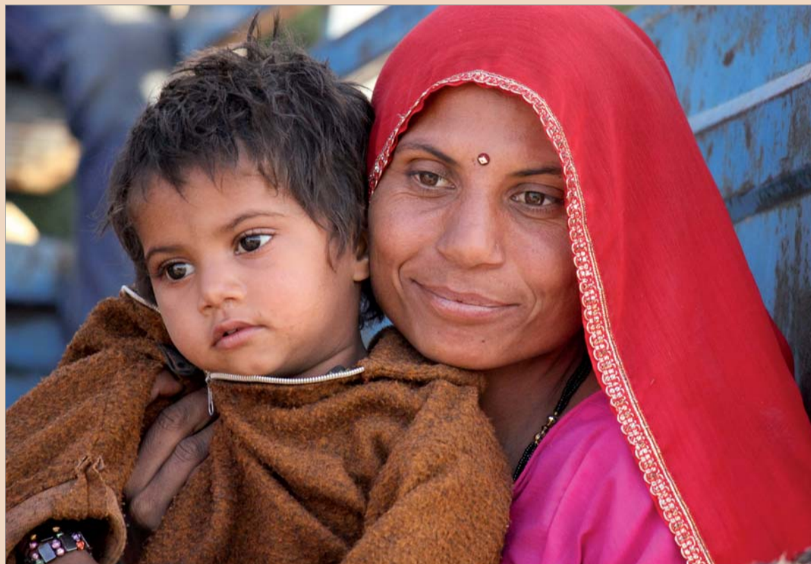
Hundreds of millions of new cases are expected to add to the burden annually.

The findings which are part of latest Global Burden of Disease study involved a systematic review of all data on untreated den-