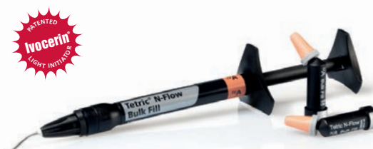
Tetric® N-Flow Bulk Fill flowable