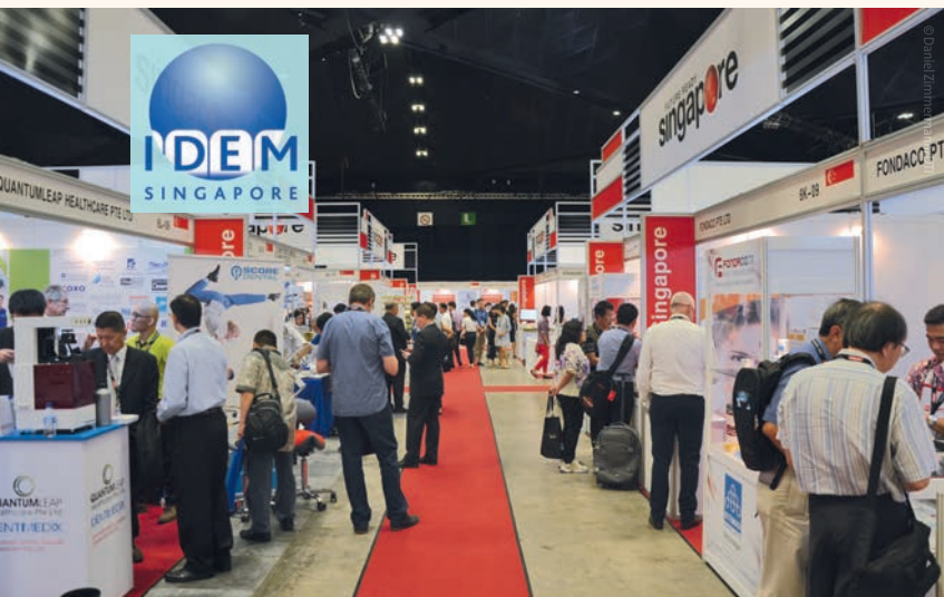
This year's edition has been the largest in numbers of visitors and exhibitors since the first meeting was held in 2000.

With 512 dental manufacturers and dealers, there were also more participants in the trade exhibition this time, including a new national pavilion organised by the Brazilian