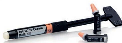
Tetric® N-Ceram Bulk Fill sculptable

* Compared with Tetric® N-Flow and Tetric® N-Ceram Data available on request.