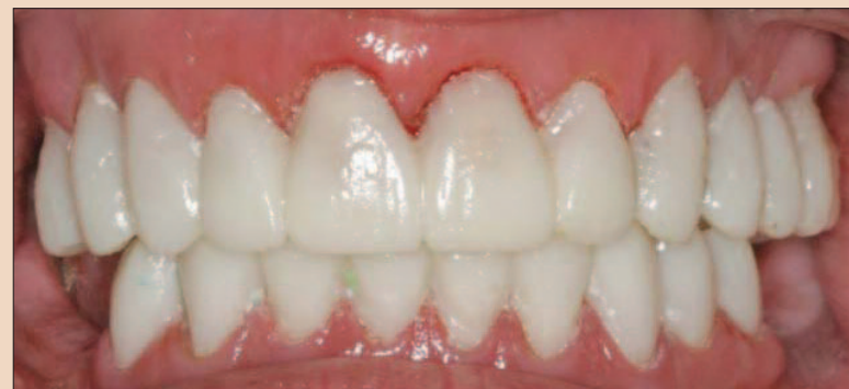
Fig. 5: Carmen's new temporaries make her feel better already.

We reviewed photographs from several smile guides with Carmen to decide how to design her new smile. We determined what she wanted her new teeth to look like, selecting shapes, embrasures, line angles and texture. We also decided on the desired colors and incisal translucency to be utilized.