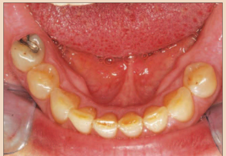
Fig. 4: Her mandibular teeth are significantly shortened by heavy wear.