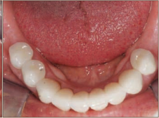
Fig. 9: The mandibular restorations add length and improve overall esthetics and function.