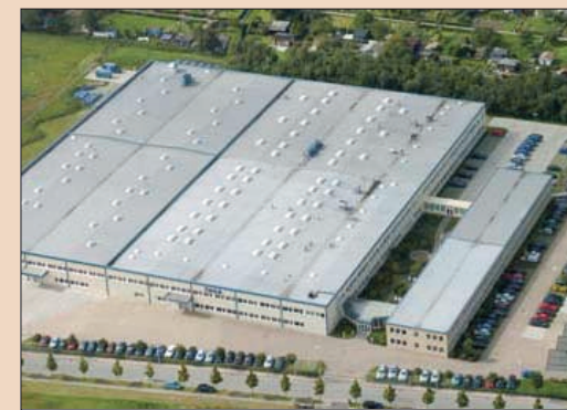
Aerial view of the VOCO headquarters in Cuxhaven in Germany.