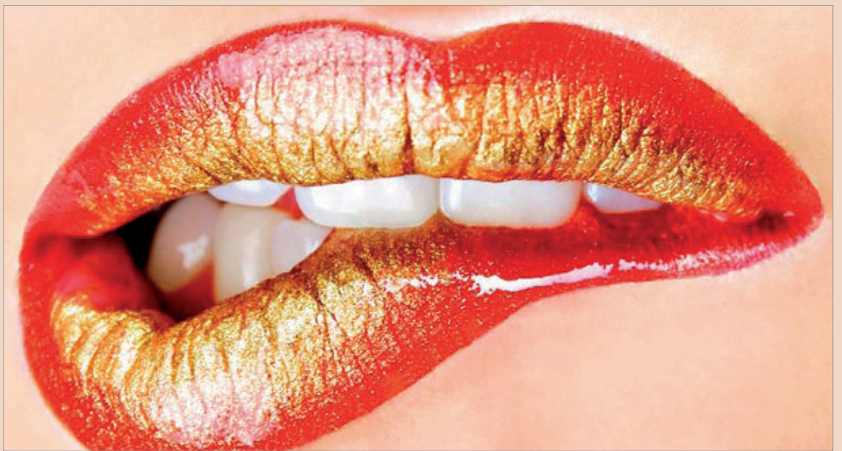
Giving patients advice sheets on sedation should help allay any concerns the patients may have

It is important not only to record how much drug has been given but also when it was given and how quickly. This information can be used to justify the dose of drug used in a particular patient. Whilst sedative drugs are given in dosages loosely based on body weight, conscious sedation drugs used in dentistry are often titrated to the patient's individual needs. The clinical notes should also contain an indication of the quality of sedation, the level of sedation and patient's response to the