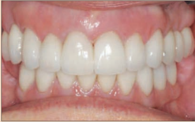
Fig. 7: Carmen's beautiful new restorations give back her smile and allow her to chew comfortably for the first time in years.