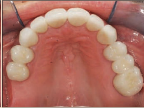
Fig. 8: The new maxillary porcelain restorations restore broken, decayed and worn-down teeth.