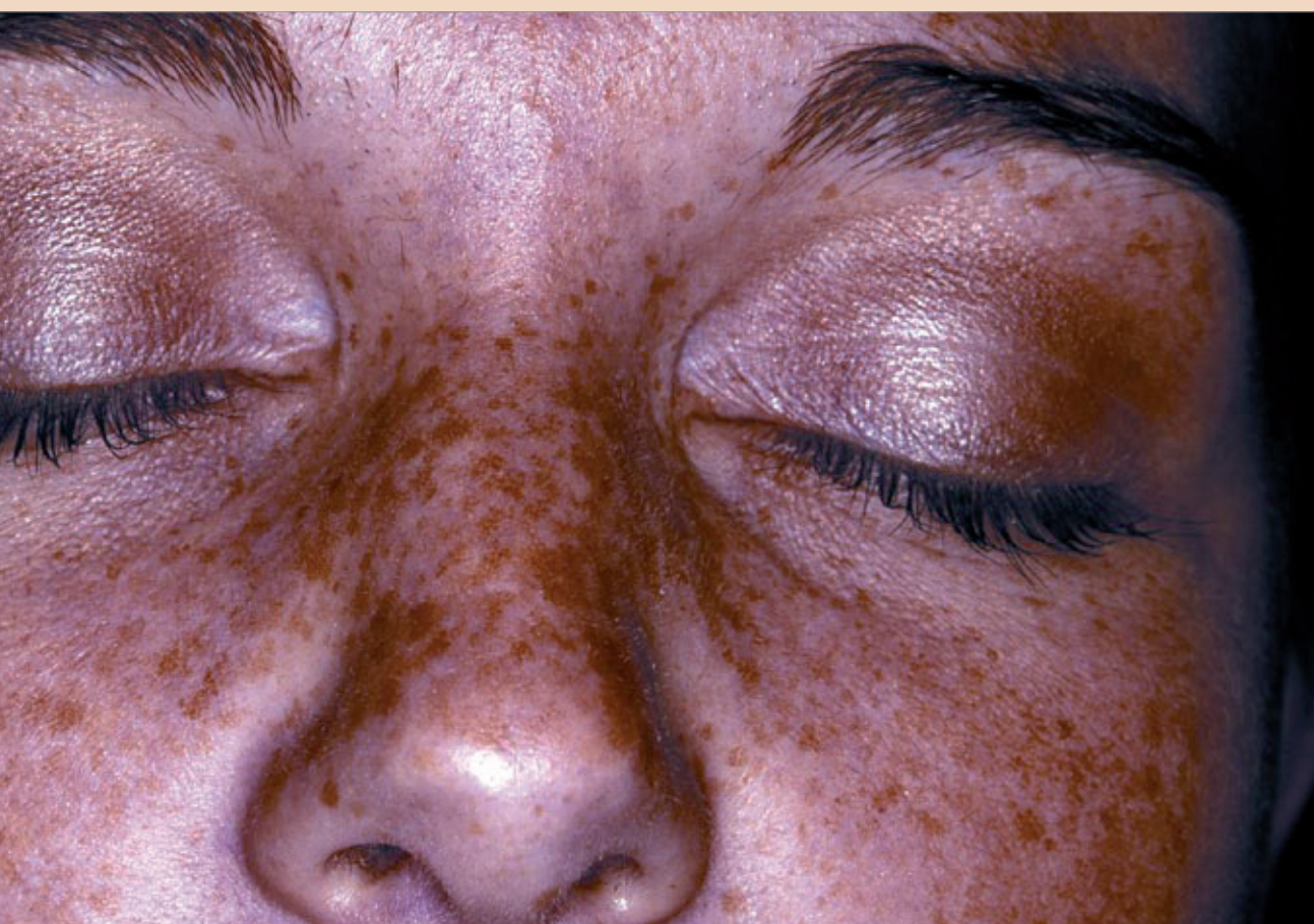
tion of patients