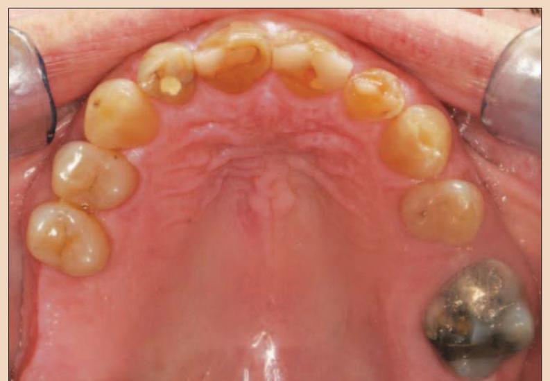
Fig. 3: Her maxillary teeth are heavily worn, have large restorations and significant recurrent decay.