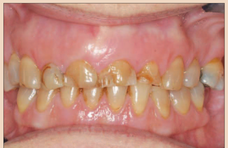
Fig. 2: Carmen's broken and heavily worn teeth make it hard for her to eat and smile.

The full-mouth Luxatemp mock-up also served as an ideal intraoral preparation guide so that depth cuts could be made into the Luxatemp and tooth structure. This allowed us to maintain even reduction and ideal orientation within the arch