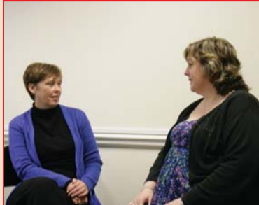
In the zone DT looks at dental nursing education