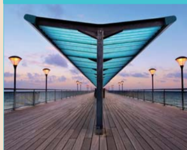
Peer to pier The BOS Conference 2012