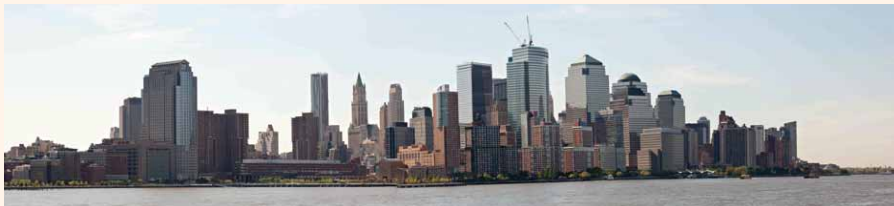
New York City skyline on the Hudson River.

(Source: Greater New York Dental Meeting)