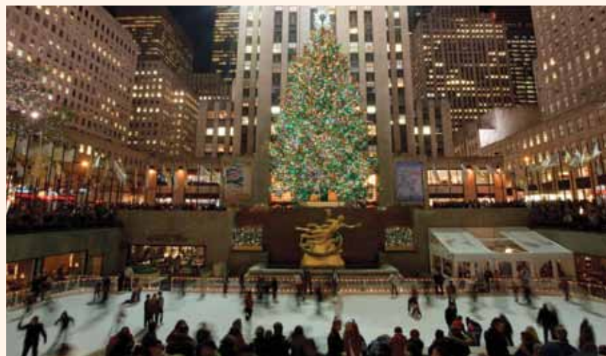
One of many iconic NYC holiday scenes: the lighted tree and ice skaters at Rockefeller Center.

(Source: Greater New York Dental Meeting)