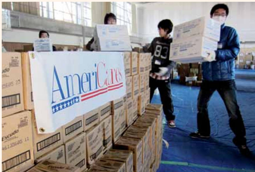
AmeriCares personnel deliver aid to evacuation centers in the early days of the disaster.